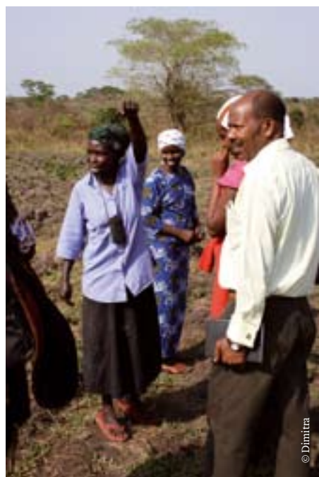
Visit to the Orib Can Women’s Group in Atana parish, Apac District.

The AMM was immediately followed by the Dimitra East Africa Partners Meeting, bringing together the different Dimitra partners in Eastern Africa, the Dimitra Brussels representative, as well as some interested Ugandan organisations. The meeting started off with a presentation and discussion on Dimitra and the importance of information, communication and networking for empowerment and development. Then WOUGNET and each of the Focal Points summarised their achievements in their participation to Dimitra, as well as the challenges they faced. Several recommendations were formulated for better cooperation, which will be taken on board by the Dimitra team to improve further collaboration. The main challenges, and hence recommendations, were related to the enormous task of covering a large region with limited means. However, participants also felt that the meeting had been useful in getting a better understanding of what Dimitra is all about, and how it could be integrated better in the respective organisation’s other activities.