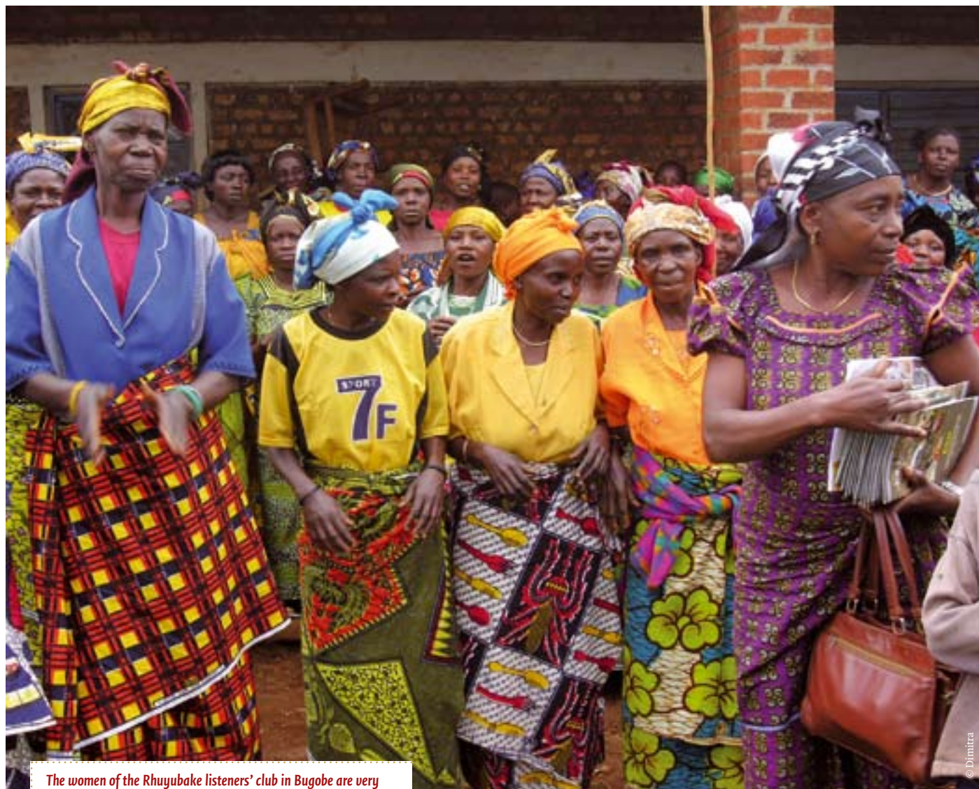
The women of the Rhyubake listeners' club in Bugobe are very committed to their new role as actors of change.

have analysed different types of behaviour, attitudes and beliefs upheld by men and women. Following on from the discussions, a message of prevention is now being created by the villagers themselves. This is the best way to make sure the message is relevant and truly makes sense to the target audience. SAMWAKI and GTZ Santé will then ensure that all of the messages and information to be broadcast on air are both accurate and reliable.