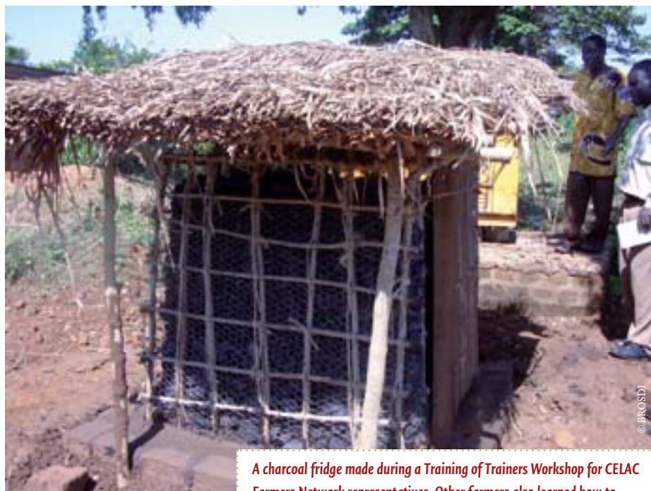
A charcoal fridge made during a Training of Trainers Workshop for CELAC Farmers Network representatives. Other farmers also learned how to construct such a fridge through information received by SMS.

As a result of the tele-conferencing, the CELAC Farmers Network members in Masaka district were able to construct a local charcoal fridge. They had received an SMS on how to construct such a fridge but had several questions, which they were able to ask at the monthly teleconference meeting. Today, several farmers have constructed such a fridge, in which they keep drinking water and their farm's produce, especially vegetables for home consumption. In an anonymous entry on the CELAC Blog, a farmer indicated that he had used the instructions to make himself a perfectly working fridge.