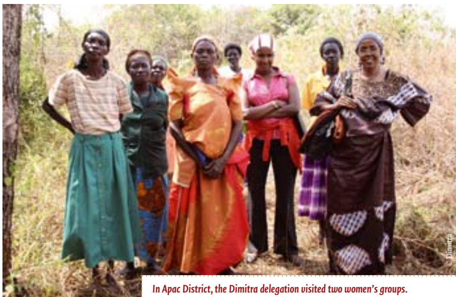
In Apac District, the Dimitra delegation visited two women’s groups. They explained about the activities and projects they have engaged in since linking up with WOUGNET’s Kubere Information Centre.

Following the two-day meeting in Kampala, the Dimitra East Africa team and the Dimitra Brussels representative went on a field visit to Apac and Lira Districts.