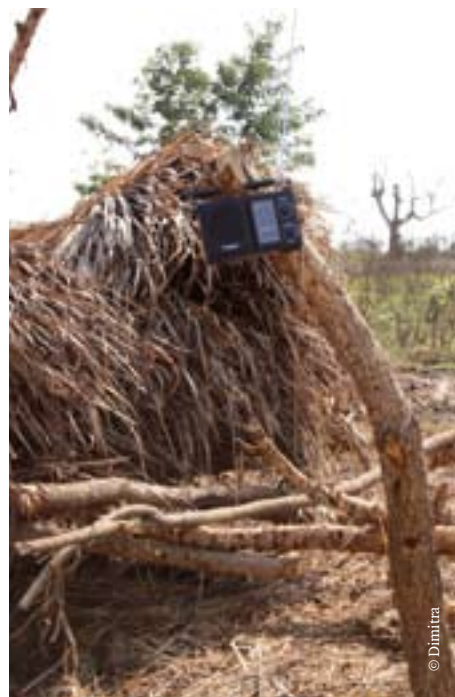
Local agricultural content has been produced and disseminated via radio and SMS messages as well as on audiotapes, video tapes, CD-ROMs and notice boards.

In 2005, a project on "Enhancing Access to Agricultural Information using ICTs in Apac District" (EAAI) was initiated to develop and improve information and communication systems so as to enable easy access to agricultural information for rural women farmers. Findings of a research study 1 undertaken in 2003 revealed lack of information as a key limiting factor to increased productivity in Apac, one of the poorest districts in Uganda. It showed