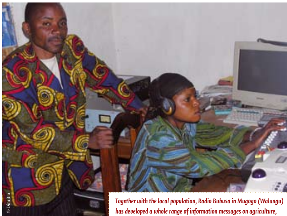
Together with the local population, Radio Bubusa in Mugogo (Walungu) has developed a whole range of information messages on agriculture, HIV/AIDS, the fight against sexual violence, the status of women, etc.

Again thanks to a radio programme, the members of the Ruhinduke listeners' club in Mugogo learned of a twofold initiative undertaken by a group of women from Fizi. On the one hand they had created a mutual assistance fund for women and, on the other hand, had begun to manufacture corrugated tiles which they placed onto their kitchen roofs, without