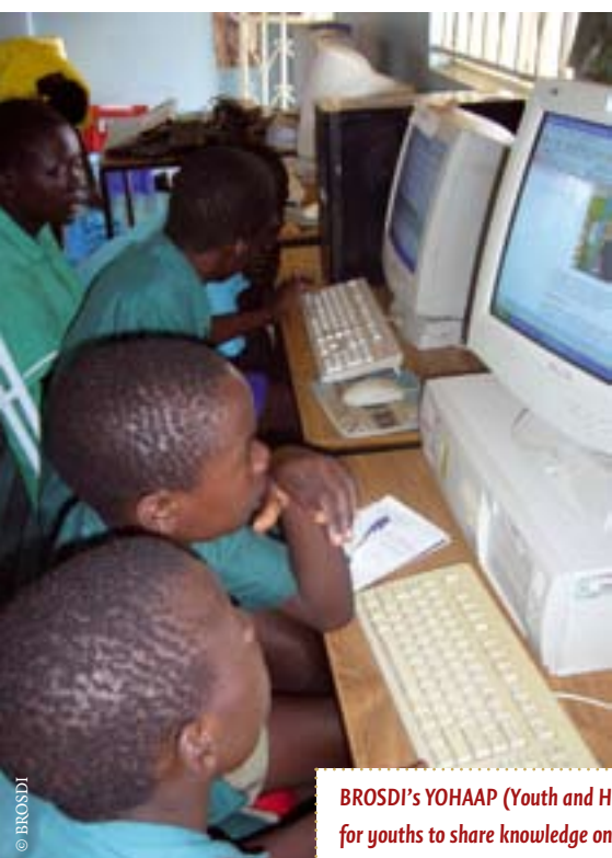
BROSDI's YOHAAP (Youth and HIV/AIDS Awareness project) health blog provides a platform for youths to share knowledge on issues pertaining to HIV/AIDS and reproductive health rights.