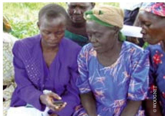
Group members have received training in the use of mobile phones, which has enabled them to better communicate among themselves and with others.

Importantly, the women farmers realise that the KIC's role is to provide information but that it is up to the individual groups themselves to develop strategies on how to best use this information. The women realise that no one will be coming to hand out money or other inputs, and that it is better to have group contribution schemes as a means of generating income to start up small projects.