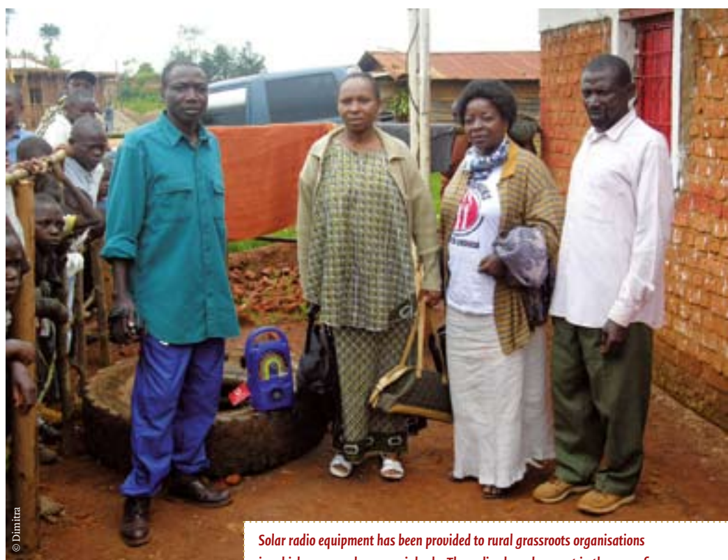
Solar radio equipment has been provided to rural grassroots organisations in which women play a crucial role. The radios have been put in the care of the women members, and are passed on to a different family each week.

The solar-power radios are striking initially by their shape. Many users thought at first