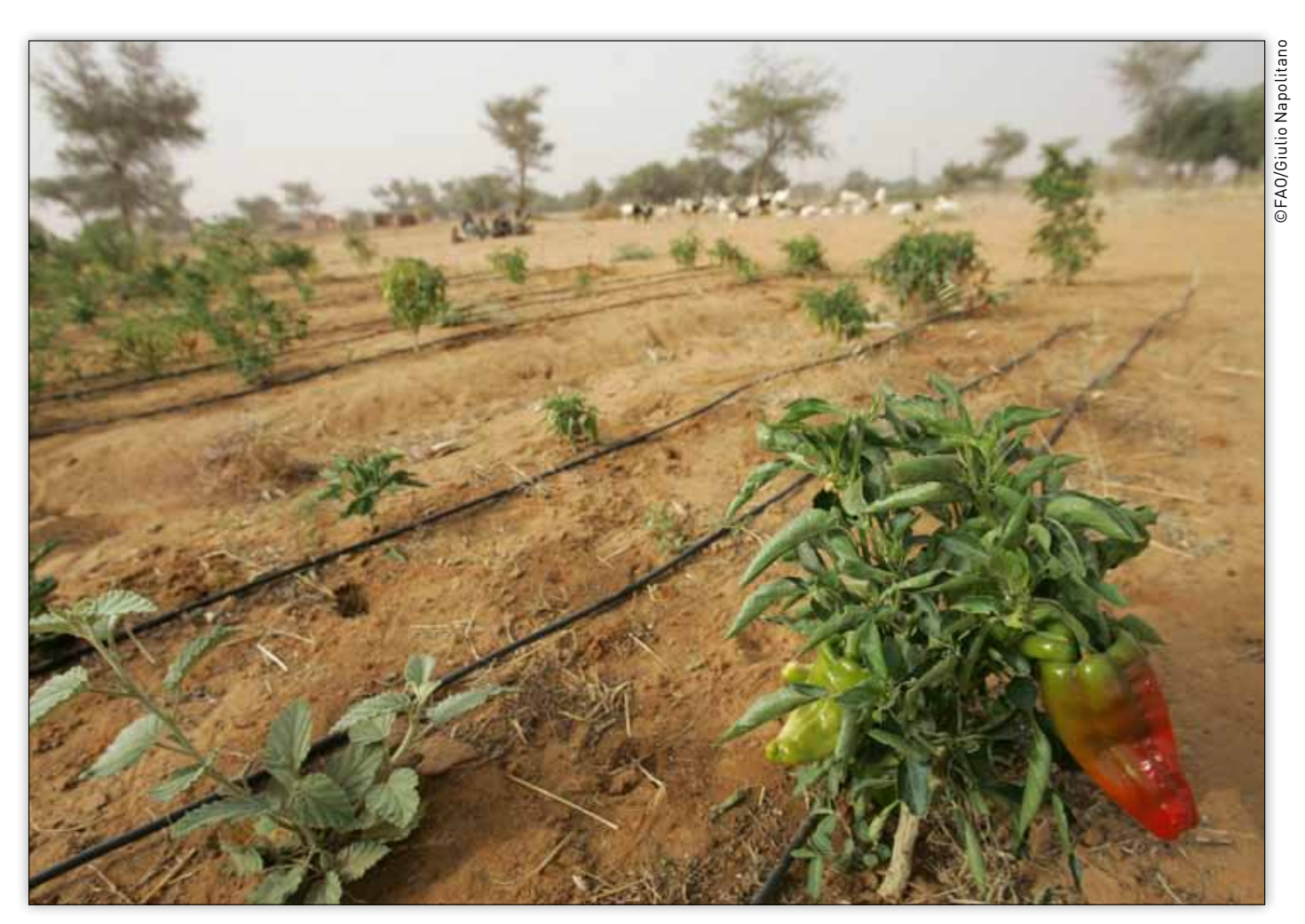
Assistance to improve food security of vulnerable households in Niger - The project aims at improving food security and nutrition of 32, 100 households through agro-pastoral production activities (agriculture and small livestock).