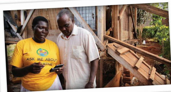
Grameen Foundation - Uganda

Challenges that prevent the maximum benefit of ICT innovations being realized can be roughly grouped into three categories: technology, human capacity, and content. Note that the challenges discussed in this forum were not strictly technology-related, but considered who innovates, who uses these innovations, and why. Observation was also made that general challenges found when working in remote rural areas do apply here, with coverage, electricity, literacy, etc., all cited as posing additional challenges to ICT-based services. The discussion focused on the challenges particular to this field.