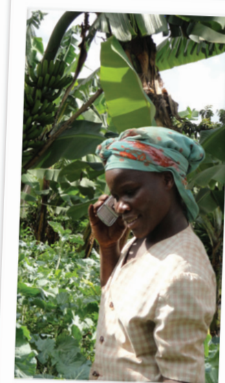
Grameen Foundation - Uganda

The results of two impact studies with controls were presented in the discussion. One from Ghana showed that access to market information resulted in a 10% increase in farmers' income, while another study in India showed no significant impact on farmers' income. Thus, even with methodologically sound work, no conclusive evidence was presented in this discussion that ICT based advisory services have a positive benefit to smallholder farmers. Other studies were mentioned in much less detail in the discussion, and can be found in the "References" section of this report. Through the discussion there were doubts raised about the appropriate methodology for researching the impact of ICT on agricultural development.