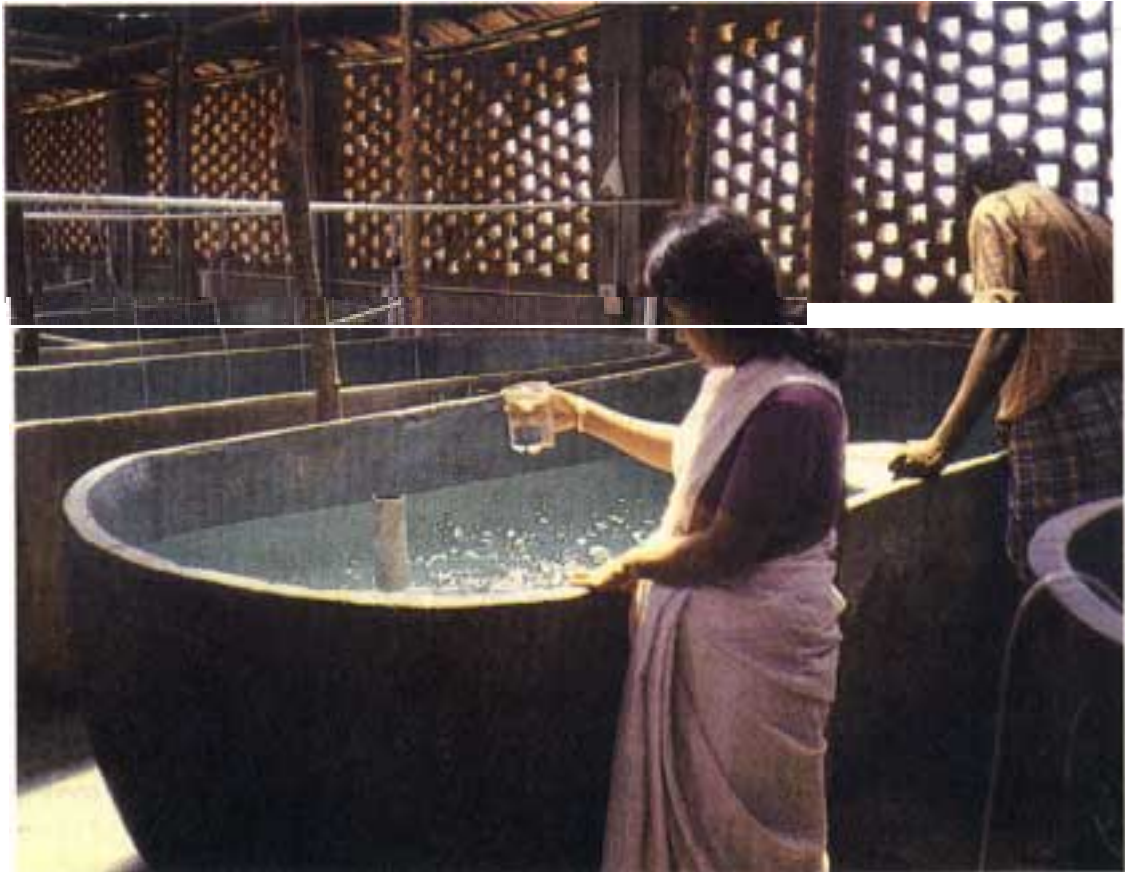
Povithra Hatcheries' shrimp hatchery, Madras, India, under construction.