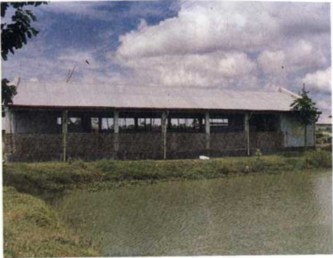
Exterior and interior views of Potiya demonstration hatchery, Chittagong, Bangladesh.