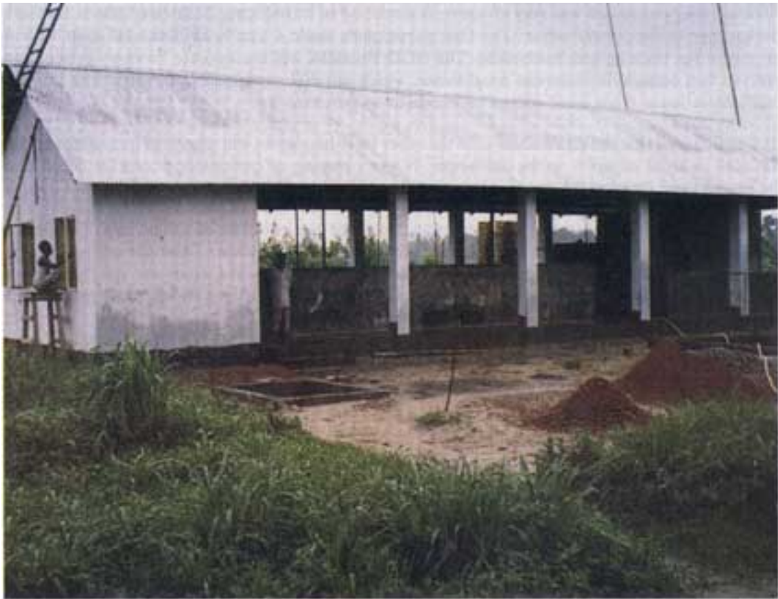
Exterior and interior views of Proshika prawn hatchery, Koittia, Bangladesh.