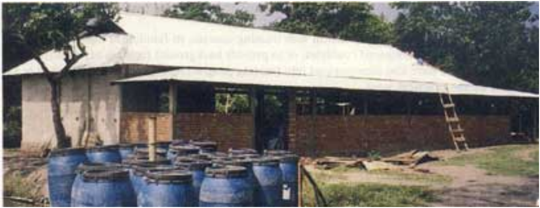
Exterior and interior views of Jalak Prawn Hatchery, Gozipur, Mymensingh, Bangladesh.