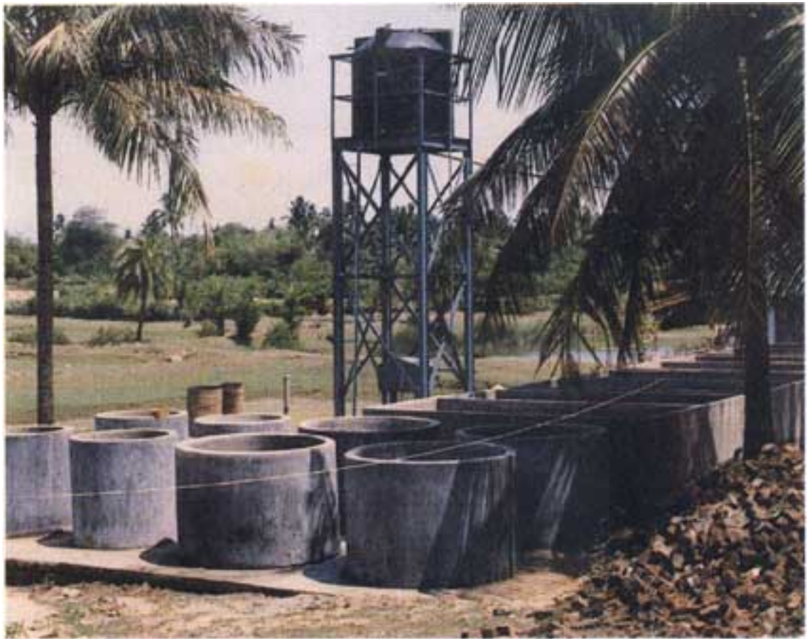
Views of the DOF shrimp/prawn hatchery, Digha, West Bengal, India.