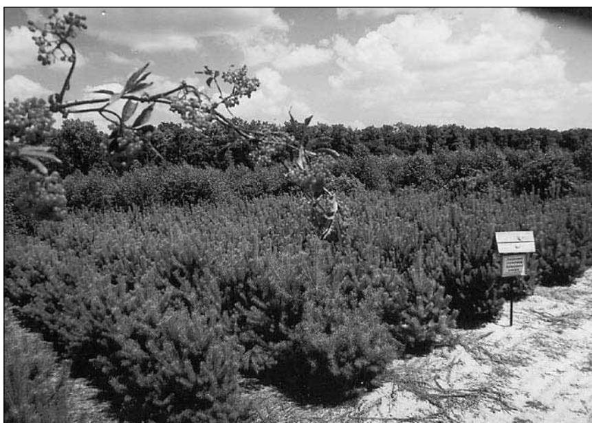
UKRAINIAN RESEARCH INSTITUTE OF FORESTRY AND FOREST MELIORATION

Ukraine has good potential for hosting afforestation projects to increase carbon sequestration (shown, a young pine plantation)