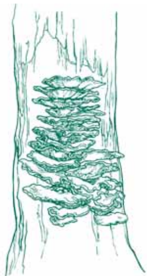
"Steps to sustainable and community-based NTFP management"

(One of the key areas of intervention of our work is to support information sharing and facilitate networking among those people/organizations working in the field of NWFPs. We therefore have no objection to any part of Non-Wood News being used, but request that the original source information be cited.)