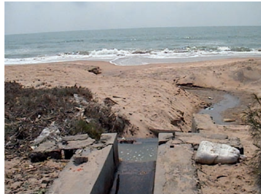
Effluent discharge into the open sea adjacent to a hatchery without any treatment increases risks of disease

The flow and processing of inlet seawater to the hatchery facilities are shown in Figure 5.