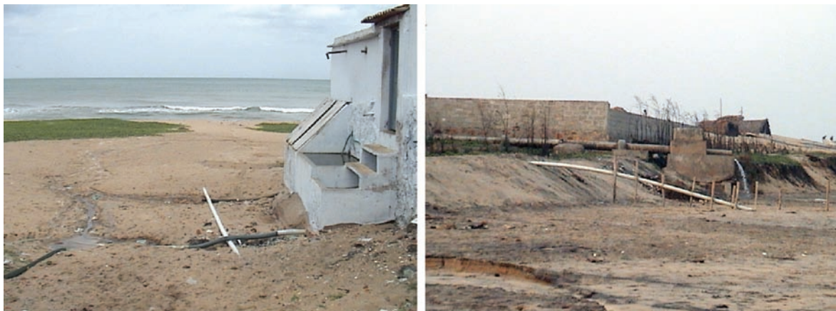
Water intakes of some commercial hatcheries and nauplius centres are located close to the effluent discharge of others

More specific water treatment procedures to be used for each phase of maturation and larval rearing are detailed in the appropriate sections.