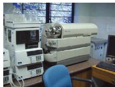
The Andhra Pradesh State Institute of Fisheries Technology (SIFT) is now equipped with modern technology to provide better service for quality seed production