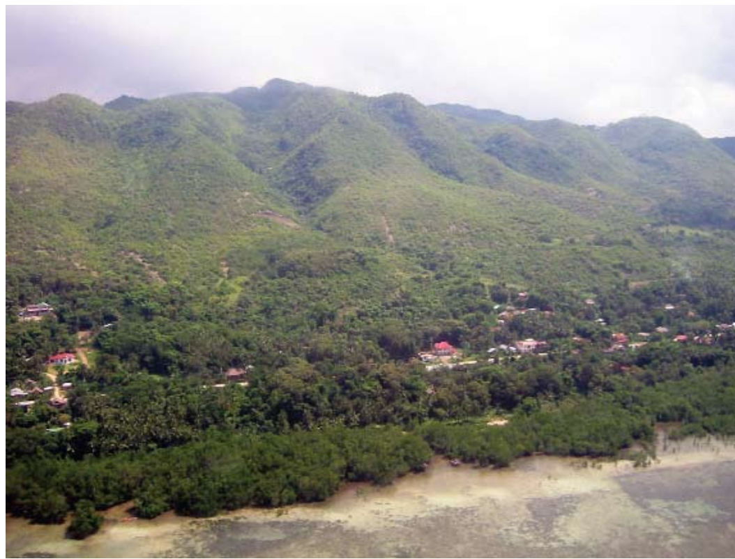
Coastal regeneration of mangroves is widespread in Bohol and communities know its value. Outmigration, too, has resulted in less cutting of mangroves for fuelwood and the limestone slopes in many areas are regenerating

What gives Ernie the heart to continue is the satisfaction of seeing people doing something in the uplands. “I’d rather be in the field and working with people, than sitting down and doing reports. One farmer