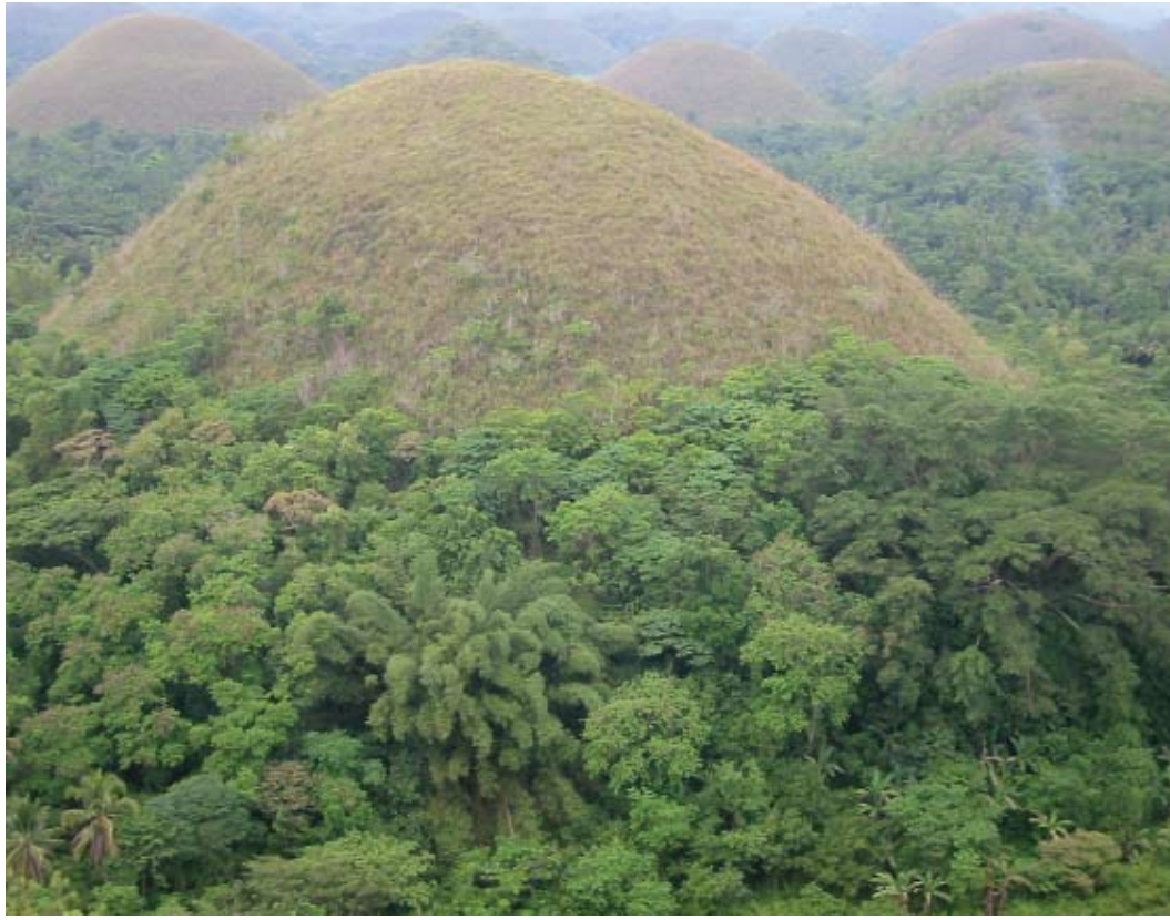
Bush regeneration at the Chocolate Hills

“I am still hopeful there will be a change of policy. Government should be more serious in its approach to forestry and local government should do its share. But there is also the problem of leadership. When a new leader comes in, the program is stalled.”