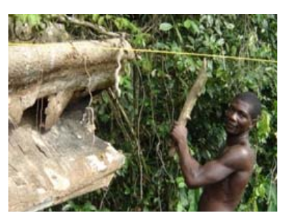
Farmer beating the bark of tree to make noise

Traditional techniques imply techniques which have been used throughout history by local communities, and of which knowledge is passed on from generation to generation. They are most often based upon scaring elephants away from fields, in the hope that the elephants will return to more natural habitat. They generally utilize low-tech materials that are widely available. Most traditional methods are of limited use as a deterrent, usually only temporarily easing the problem, or shifting it to a neighboring area.