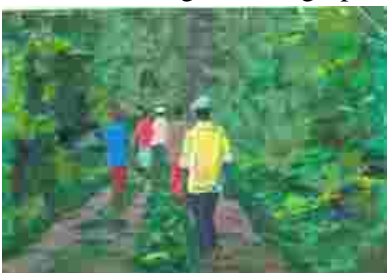
A cadre of community scouts on patrol

the techniques in the community and teaching the techniques to community members and even to other communities. The situation should be monitored closely not only for its impact on the issue of crop raiding elephants, but also in terms of responsibility and accountability to the larger community. Materials which are needed, such as boots, torches and note books, should be arranged by the community through, for example, a community funds which is established through voluntary contributions or levies on crop production or animals hunted.