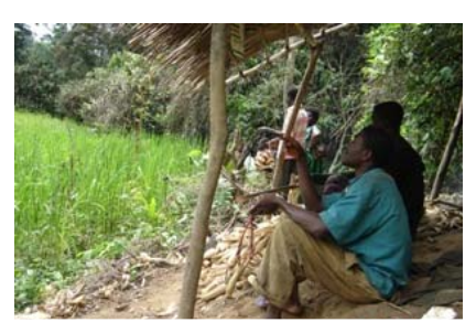
Farmers guarding a rice field

Traditional methods are typically hard to evaluate objectively – often being used in combination with each other and sometimes with other methods. Nonetheless, as a countermeasure they show some degree of success when compared to areas where no crop defense is practiced, and most particularly where elephants, for whatever reason, do not continually challenge the deterrence system. These methods should still be used as much as possible if farmers consider that they work.