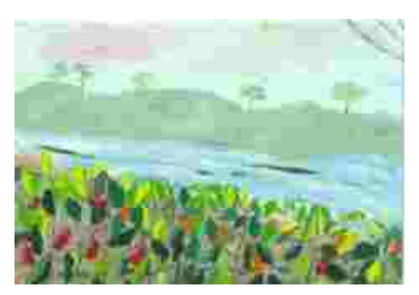
Chili pepper cultivated at the boundary of a forest

Cultivation of non-target crops : Little research exists on elephant 'preferences' for particular crops, but there are a few crops that elephants appear not to eat. Many of the crops currently grown by small scale farmers are vulnerable to wildlife. But ginger and chili peppers are cash crops that are resistant to damage by elephants. By growing crops such as ginger and chilies, rural farmers are able to harvest a crop that is commercially viable, resistant to elephants, and useful in the defense of their fields.