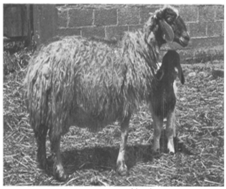
Awassi ewe and lamb