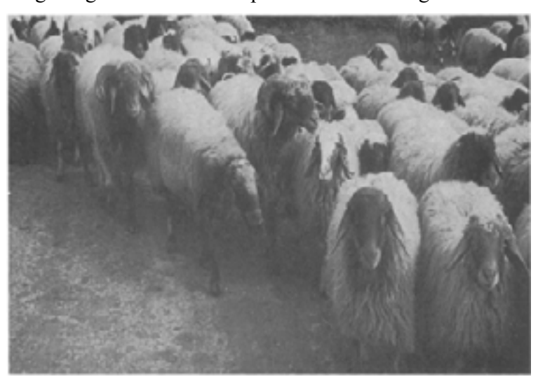
Awassi flock bred for milk

In large parts of the subtropical, semi-arid Awassi breeding area, the sheep depend for their sustenance throughout the year solely on natural grassland growth. In the winter and spring, they enjoy the new grazing that sprouts up after the rains. When the winter rains have been plentiful, the Bedouin do not water their flocks as these obtain sufficient moisture from the young juicy plants. In summer, the sheep live on weeds and the stubble, gleanings and fallen grains on the harvested fields of the fellahin. In autumn and early winter, they have to content themselves with the meagre herbage they may find on hillsides or in valleys. This is the time of scarcity of nourishment when the Awassi sheep use up the fat stored in their tails during the months of plenty. In the season of scanty grazing or during violent rain storms, fellahin flocks may be given some tibben, that is, straw crushed by primitive threshing methods. In some parts of the breeding area, the Awassi flocks are not stationary but travel with their nomad owners over long distances in search of grazing. Stationary Awassi flocks owned by fellahin are commonly grazed in the neighbourhood of the villages. When the ewes are in milk, they are taken to the tents of the Bedouin or the villages of the fellahin in the evening to be milked, and rest in the vicinity during the night. During the season when the ewes are dry, they remain in the field during the night together with the shepherds and their dogs.