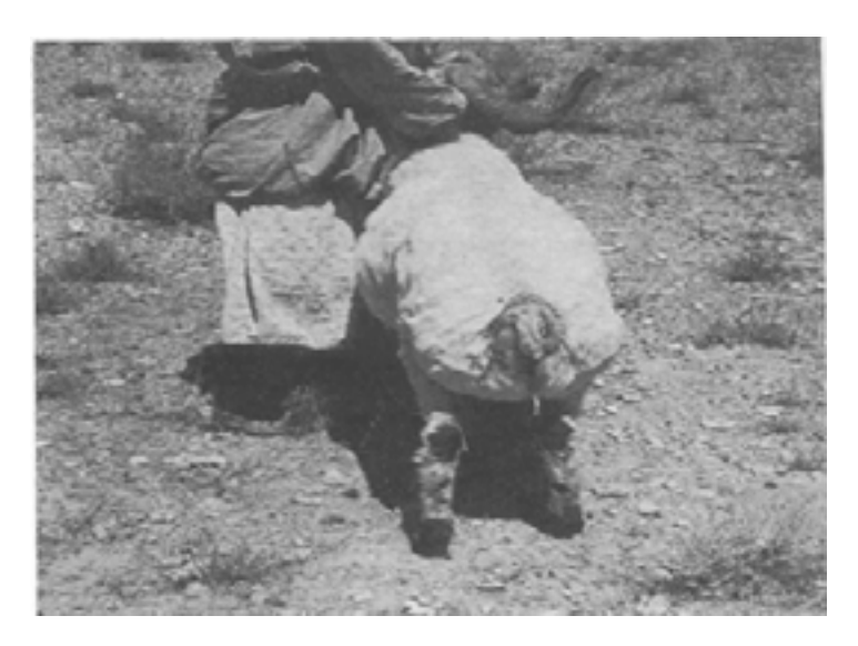
The fat tail of an Awassi ram

In Awassi flocks in Lebanon, the normal yield of scoured wool averages 50-60 percent. At an experimental farm, the average annual yield in two successive years was 66.3 percent (McLeroy and Kurdian, 1958). In Egypt, wool of six months' growth from Awassi ewes of Syrian origin yielded 74.6 percent clean wool. In the Kingdom of Saudi Arabia, the mean percentage yield of clean wool from Awassi ewes of Syrian origin was 77.9 and from lambs 77.5. In Anatolia, a flock of Awassi sheep kept at a research station had an average clean wool yield of 61.2 percent during two years of examination. In another study, the average yield of Turkish Awassi wool was 66.8 percent. Wool samples taken from the hip region had a clean fibre yield of 77.0 percent for rams, 71.7 percent for ewes, and 78.2 percent for yearlings. In Iraq, the mean yield of wool of 12 months' growth from ewes of different ages was 84.8 percent, the low shrinkage being attributed to the comparatively small number of sudoriferous and sebaceous glands in the wool follicle structure.