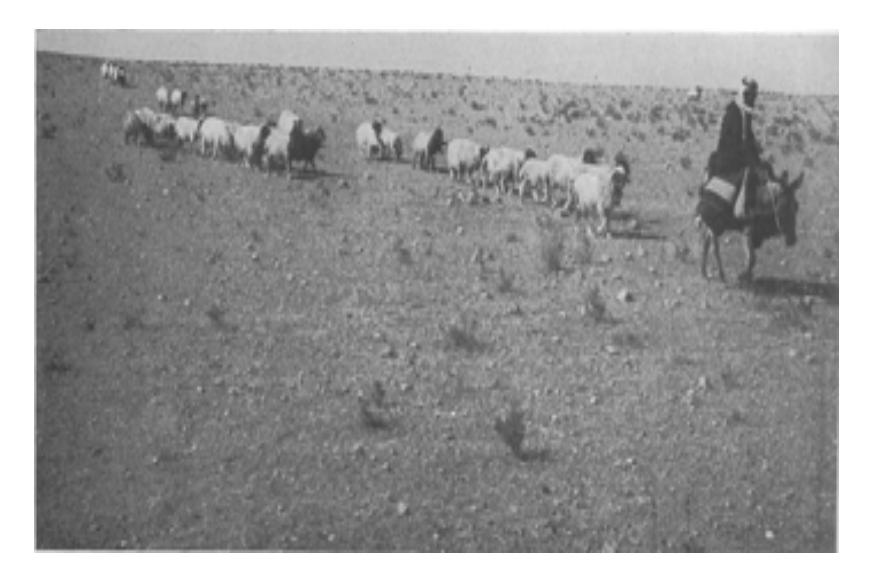
Awassi sheep following their shepherd on the Syrian steppe