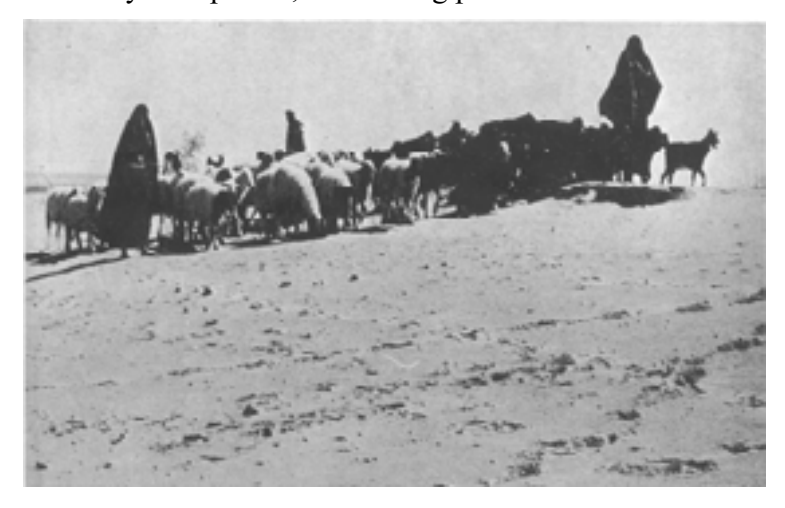
Bedouin flock of Awassi sheep and desert goats

with a small, thin dewlap and prominent brisket. In unimproved flocks, narrowness at heart is a common weakness. The back is long and straight, the anterior part of the rump relatively broad and nearly on a level with the back, but the rump is short with a slope to the fat tail. The barrel is deep and wide. The legs are of medium length and thickness; not as short and sturdy as those of the early maturing mutton breeds of the United Kingdom nor as long and thin as the legs of the thin-tailed sheep of the savanna region of West Africa. They are usually well placed, with strong pasterns and durable hoofs.