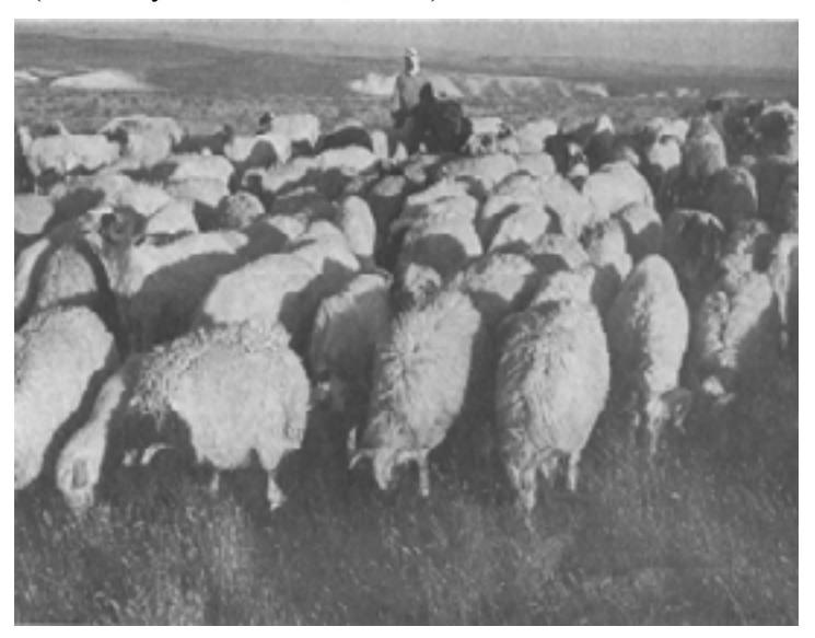
Awassi sheep on the Syrian steppe

The mean gestation period in an Awassi flock in Lebanon has been reported to be 149.5 days for male lambs and 148.6 days for females (Choueiri, Barr and Khalil, 1966). In another Lebanese flock, the average gestation length for single-born lambs was 151.2 days (Fox et al. , 1971) while, at the American University Farm in Lebanon, it was found to be 152.6 days (McLeroy and Kurdian, 1958).