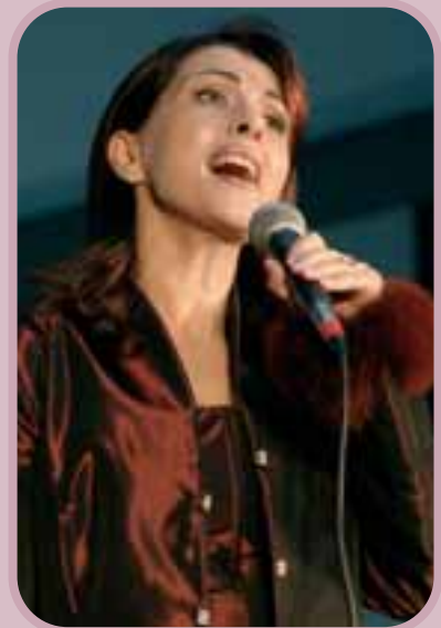
FAO Goodwill Ambassador Magida Al Roumi singing at World Food Day ceremonies, FAO Headquarters, Rome, Italy

Ms. Al Roumi has also performed in awareness-raising and fundraising concerts dedicated to FAO in Tunis, Cairo and Alger over the past years.