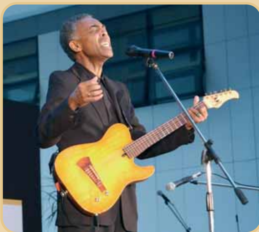
FAO Goodwill Ambassador Gilberto Gil performing during World Food Day ceremonies at FAO Headquarters, Rome, Italy.

Gilberto Gil is one of the most important singers, composers and instrumentalists of modern Brazil. During an artistic career spanning more than three decades, he has recorded over 30 albums, with many being released in Asia, Europe, Latin America and North America. He is a living legend who has shown a remarkable, unique rhythmic versatility through his production. Gilberto Gil has devoted considerable time to social and humanitarian activities in recent years, for which he has earned the love and admiration of people all over the world. Nominated FAO Goodwill Ambassador on 16 October 2001, Gilberto Gil has recorded numerous testimonials in support of FAO's campaign to eradicate hunger in the world, and most recently for the mega event “Música vs. Hambre” held in Asunción in September 2006, on which occasion his spot was broadcast all over the Latin America region in support of FAO. He also featured in numerous PSAs in support of FAO on major international magazines.