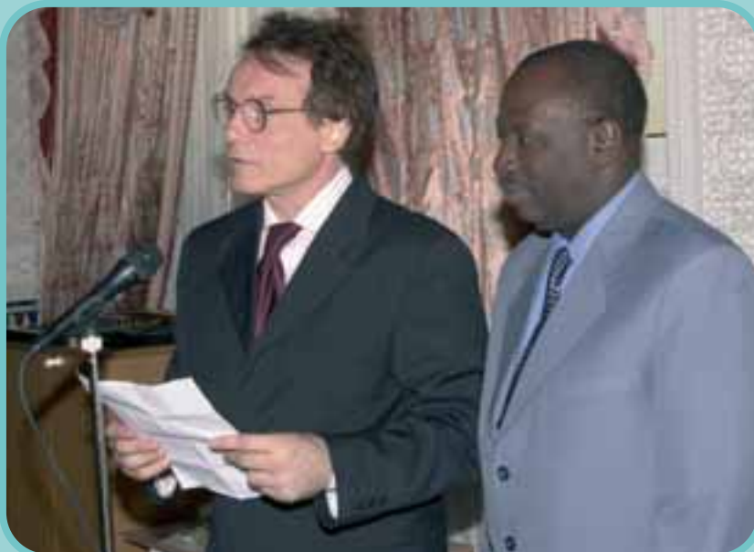
Massimo Ranieri accepting his appointment as FAO Goodwill Ambassador from FAO Director-General Jacques Diouf during World Food Day ceremonies, Rome, Italy.

Massimo has regularly participated in campaigns to draw attention to the less privileged in his home country, and he has often urged his audiences to show solidarity with the underprivileged. At concert appearances, he often speaks about his role as an FAO Goodwill Ambassador and the plight of the poor and hungry, urging his audiences to support rights to survival.