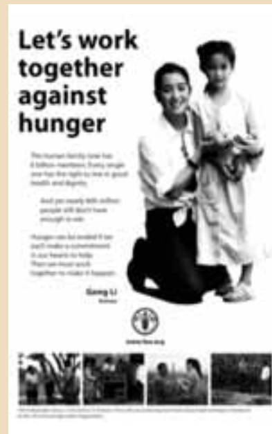
A public service announcement (PSA) "Let's work together against hunger," featuring FAO Goodwill Ambassador Gong Li visiting FAO projects in China.

Since October 2002, Gong Li has lent her image to an FAO public service advertisement published by the major Italian magazines and international magazines.