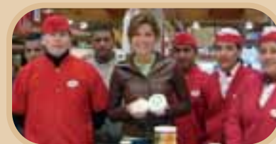
FAO Goodwill Ambassador Justine Pasek visiting with participants of FAO projects on a field visit in Peru.