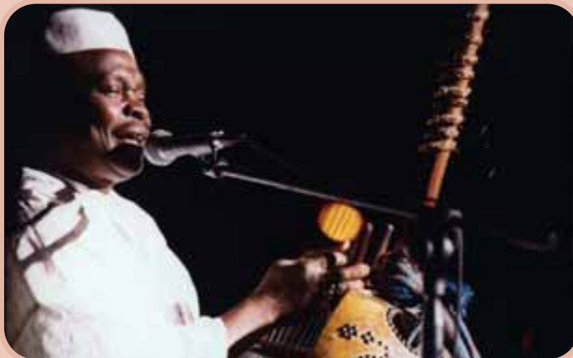
West African singer Mory Kanté performing during a World Food Day concert in his role as FAO Goodwill Ambassador, Rome, Italy.

In July 2008, he was called to perform as guest star, in his capacity as FAO Goodwill Ambassador, in a gala concert in Turin, Northern Italy, and the related press conference focused on FAO and his role as Goodwill Ambassador.