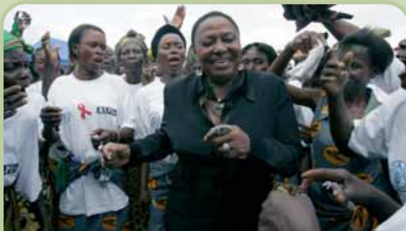
Miriam Makeba meeting with women participating in FAO projects during her visit to the Democratic Republic of the Congo in her role as FAO Goodwill Ambassador.

Following the duty travel, Ms. Makeba has been awarded the price "International Award for Social Engagement", in her capacity as FAO Goodwill Ambassador, for the work done and commitment towards helping women victims of sexual violence in the DR of Congo. (The Minerva Award, first prize dedicated to women, is an internationally recognized event focused towards highlighting the social, humanitarian and professional commitment of distinguished women).