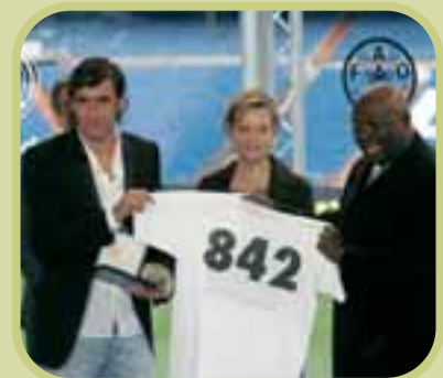
FAO Director-General Jacques Diouf enlisting the help of international star Spanish footballer Raúl González as FAO Goodwill Ambassador in the fight against world hunger, Madrid, Spain.

In May 2008 Raúl González was awarded the first edition Spanish prize for solidarity in sports for 30 000, which he donated to fund five TeleFood fighting-hunger projects.