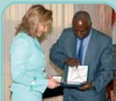
FAO Director-General Jacques Diouf appointing Paraguay's First Lady, Her Excellency Ms. María Gloria Penayo de Duarte, as first Extraordinary Ambassador of FAO during World Food Day ceremonies, Rome, Italy.

the Programme of Resource Generation through the Soybean (PROGRESO) and the installation of more than 100 soybean processing machines. Immediately following her appointment as FAO Extraordinary Ambassador, the First Lady organized and was patron of the mega concert “Música vs. Hambre”, held at the Estadio de Chaco in Asunción, Paraguay, on 21 September 2006. The event, the first concert of this magnitude ever organized in Paraguay, featured a prestigious international casting which included FAO Goodwill Ambassadors Al Bano, Noa and Ronan Keating. The concert was very successful in terms of public attendance, media coverage, awareness-raising and fundraising in support of TeleFood projects. In her capacity as Extraordinary Ambassador of FAO, Mrs. Penayo de Duarte tirelessly attends intergovernmental meetings in the Latin America Region and organizes press conferences and encounters with the media during which she speaks about her role as FAO Goodwill Ambassador.