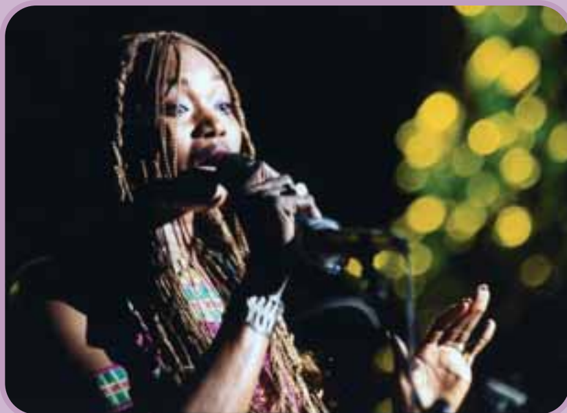
FAO Goodwill Ambassador Oumou Sangaré singing at an World Food Day event in Rome, Italy.

She starred with a musical group in an awareness-raising event dedicated to FAO that was held in Rome in 2004 and performed successfully during the World Food Day celebration at FAO HQs on 16 October 2006.