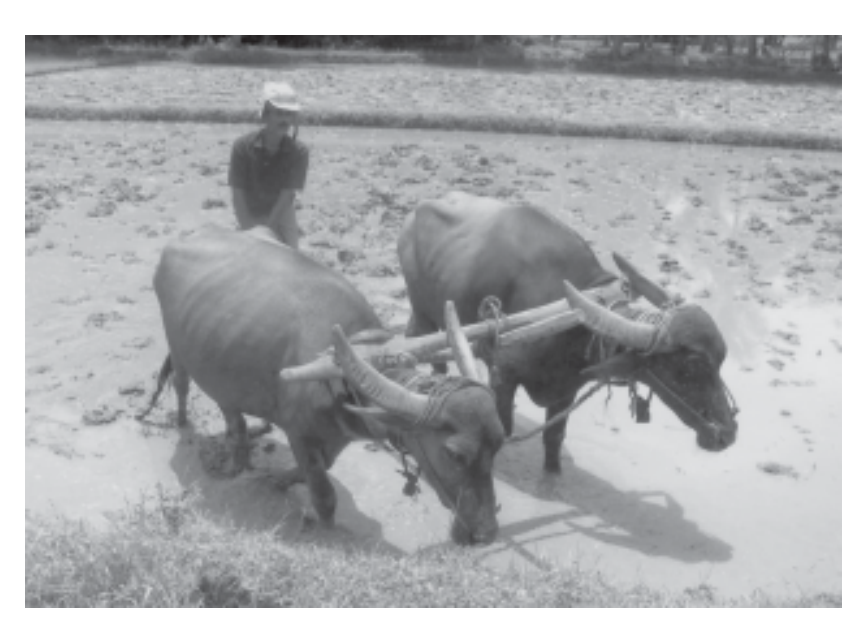
Figure 6. South Kanara males in wet fields operations.