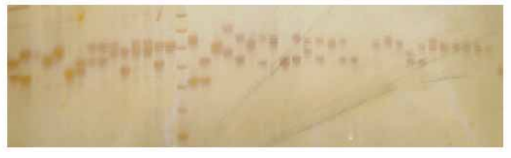
Figure 8. Resolution of genotypes at microsatellite locus ILSTS 058 in a silver stained Urea-PAGE gel.