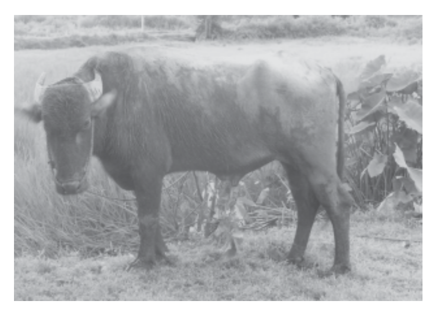
Figure 4. South Kanara bull.

varied from 420 to 2520 litres with a mean of 1 206.8±110.1 litres (n=44). South Kanara buffaloes have relatively long productive life spans as demonstrated by animals with more than five calvings commonly found in the villages. Age at first calving and calving interval varied from 30 to 60 months and 12 to 36 months respectively. The average age at first calving was estimated to be 41.4±1.9 months (n=38) and the mean calving interval was 543.4±51.3 days (n=36).