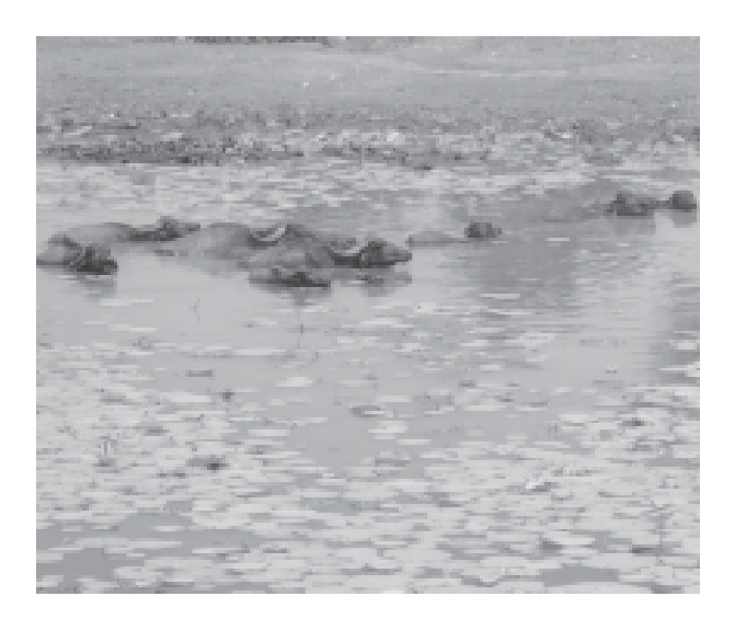
Figure 3. South Kanara buffaloes wallowing in a pond.