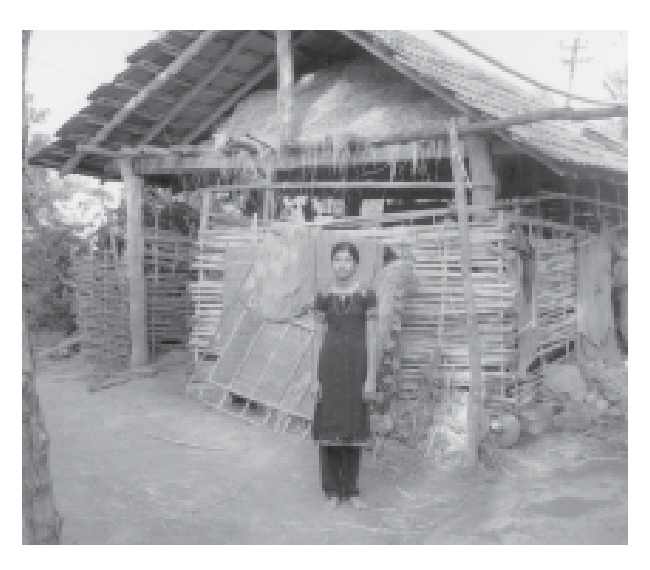
Figure 2. Typical animal house in the breeding tract.

Paddy straw, dry mixed grasses and green grasses are the main sources of roughage. Wheat bran, cotton seed cake, groundnut cake and rice bran are given as concentrates. About half (45.5%) of the farmers provide concentrates to the milking animals; 0.5 to 2 kg of concentrate is usually given to the lactating animals at the time of milking. Some farmers even feed the animals with kitchen wastes and hotel wastes; this practice is more prevalent in the urban areas.