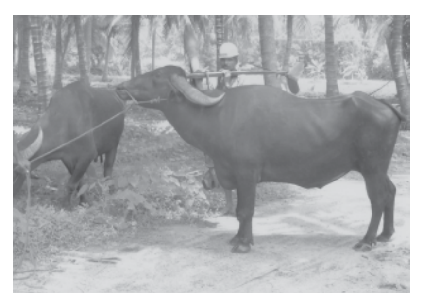
Figure 7. South Kanara working buffalo.