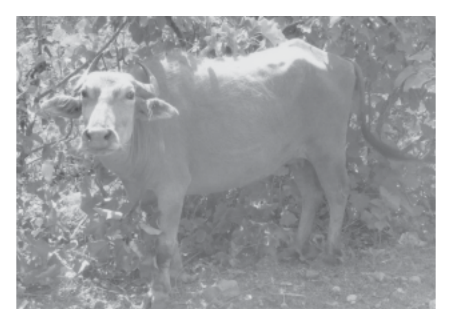
Figure 5. South Kanara she-buffalo.