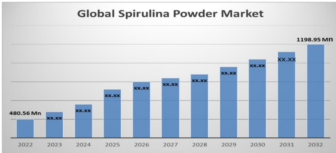
Figure 1. Global Spirulina Powder Market Size (2022 to 2032).

https://www.sphericalinsights.com/reports/spirulina-powder-market