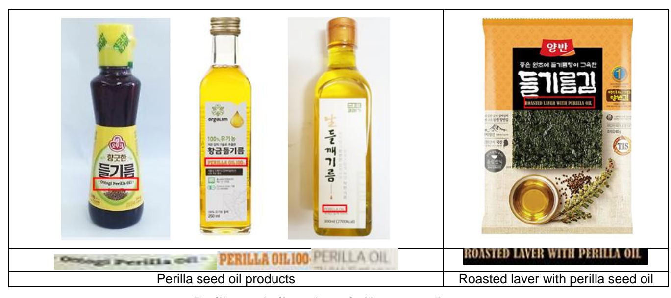
< Perilla seed oil products in Korean market>