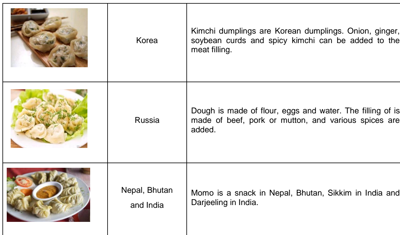
Table 1 Dumplings with various cooking ways in different countries

Quick frozen dumplings are widely eaten in China and other parts of the world. Japan, the United States, Germany, Poland, Russia, Nepal and other countries all have similar dumpling products. Although different countries have different ways of making dumplings, each with its own characteristics, they are all made from wheat flour or other starch-rich flour as the dough, stuffed with meat, eggs, or vegetables and other materials as the fillings.