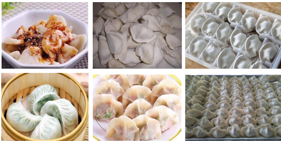
Figure1 Various Jiaozi-dumpling in China

There are various Jiaozi-Dumpling in China, see Figure 1.