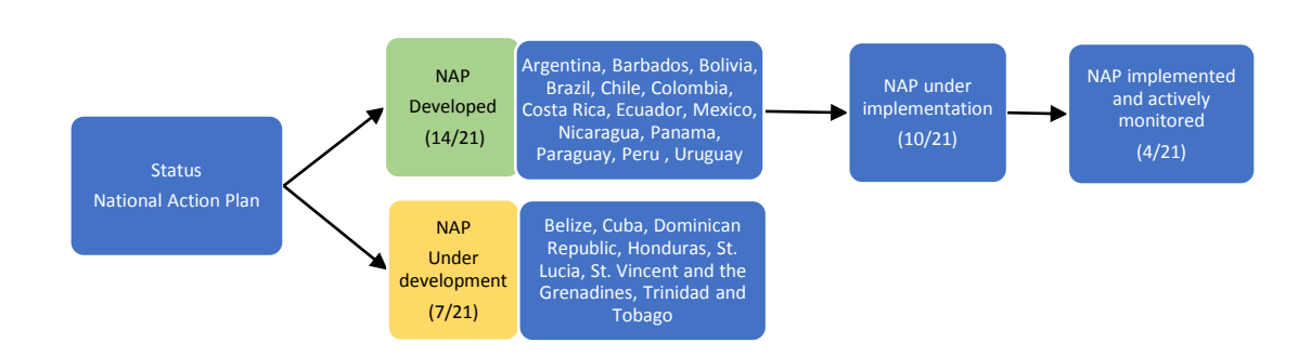
Figure 3. Status of AMR National Action Plans in LAC. (n = 21 LAC countries)