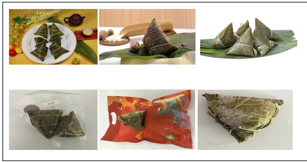
Figure 2 Different kinds of Chinese Zongzi

There are also many similar products in the international market, see Table 1.