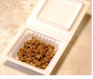
content of product