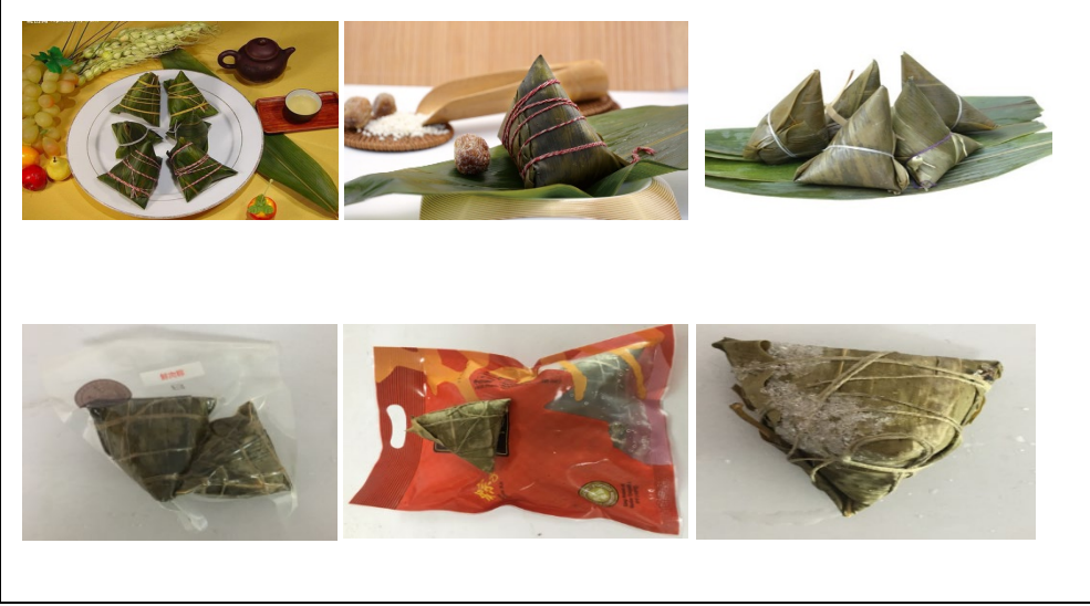
Figure 2 Different kinds of Chinese Zongzi

For different kinds of Chinese Zongzi, see Figure 2.