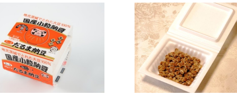
product in retail container