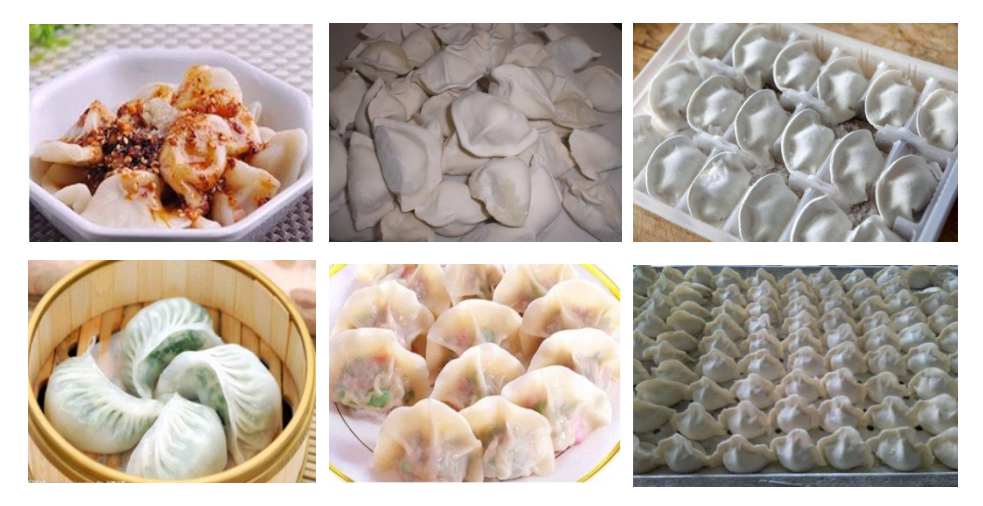
Figure1 Various dumpling in China

There are various Dumpling in China, see Figure 1.