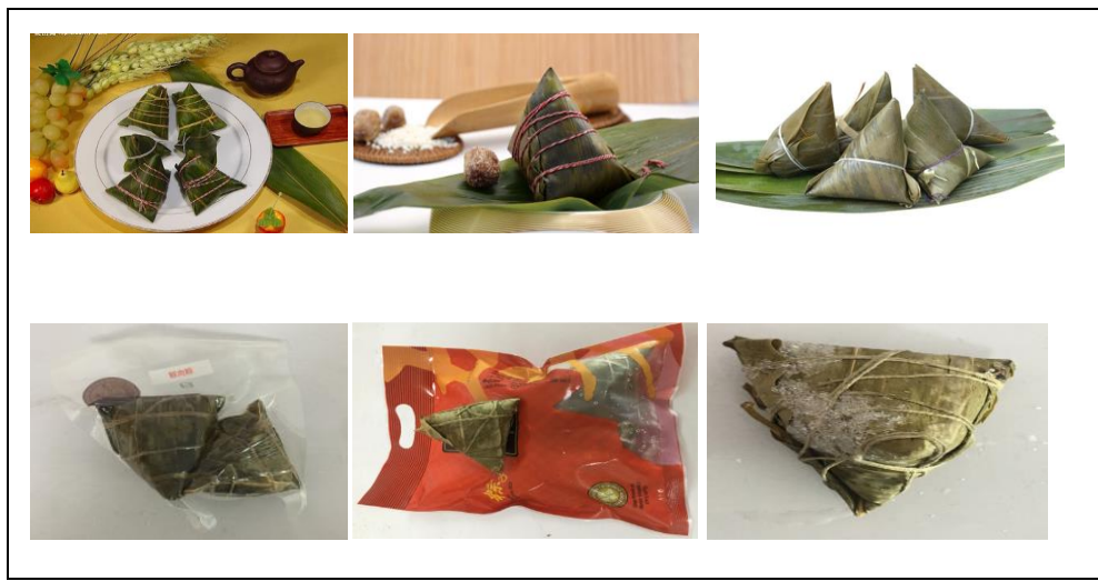
Figure 2 Different kinds of Chinese Zongzi

There are also many similar products in the international market, see Table 1.