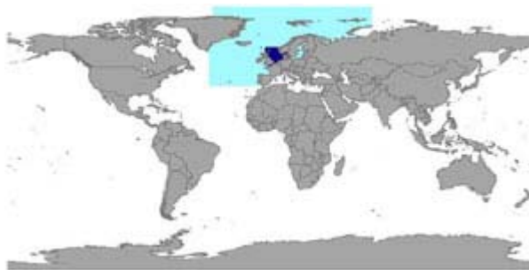
FAO Fishing Statistical Areas 27.3.a Skagerrak and Kattegat (Division IIIa) 27.4 Subarea 27.4 - North Sea (Subarea IV) 27.7.d 0 Eastern English Channel (Division VIIId)

The purpose of this tool is to highlight on a map the distribution area of a marine resource, based on the list of areas used to represent its distribution. In addition, FAO major fishing areas intersecting these areas can be used in the mapping process, e.g. to define the default zooming extent. This intersection is calculated using a relational table which provides the list of FAO major fishing areas for any area referenced in the RTMS.