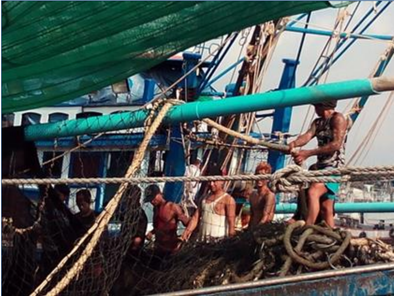
Luz Baz Abella, International Transport Workers' Federation (ITF)