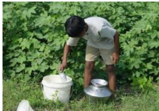
Young boy performing hazardous tasks handling pesticides for application