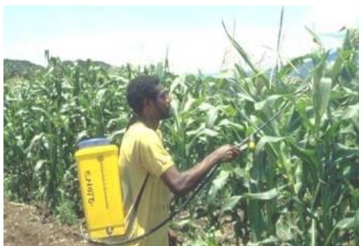
Spraying pesticides without protective clothing

These recommendations may provide guidance to drafting of regulations, to preparation of extension programmes and to reviewing and approving of label instructions.