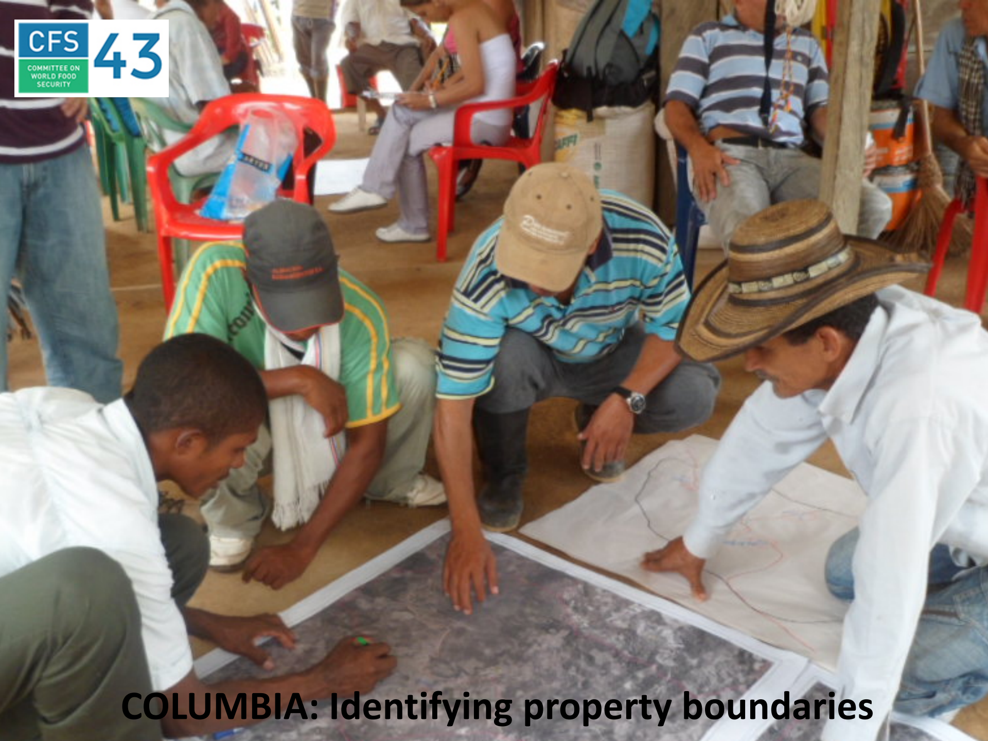
COLUMBIA: Identifying property boundaries