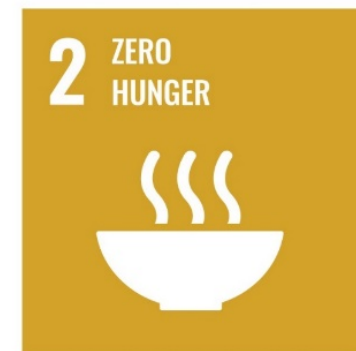
SUSTAINABLE DEVELOPMENT GOALS, ESPECIALLY SDG2 - ZERO HUNGER