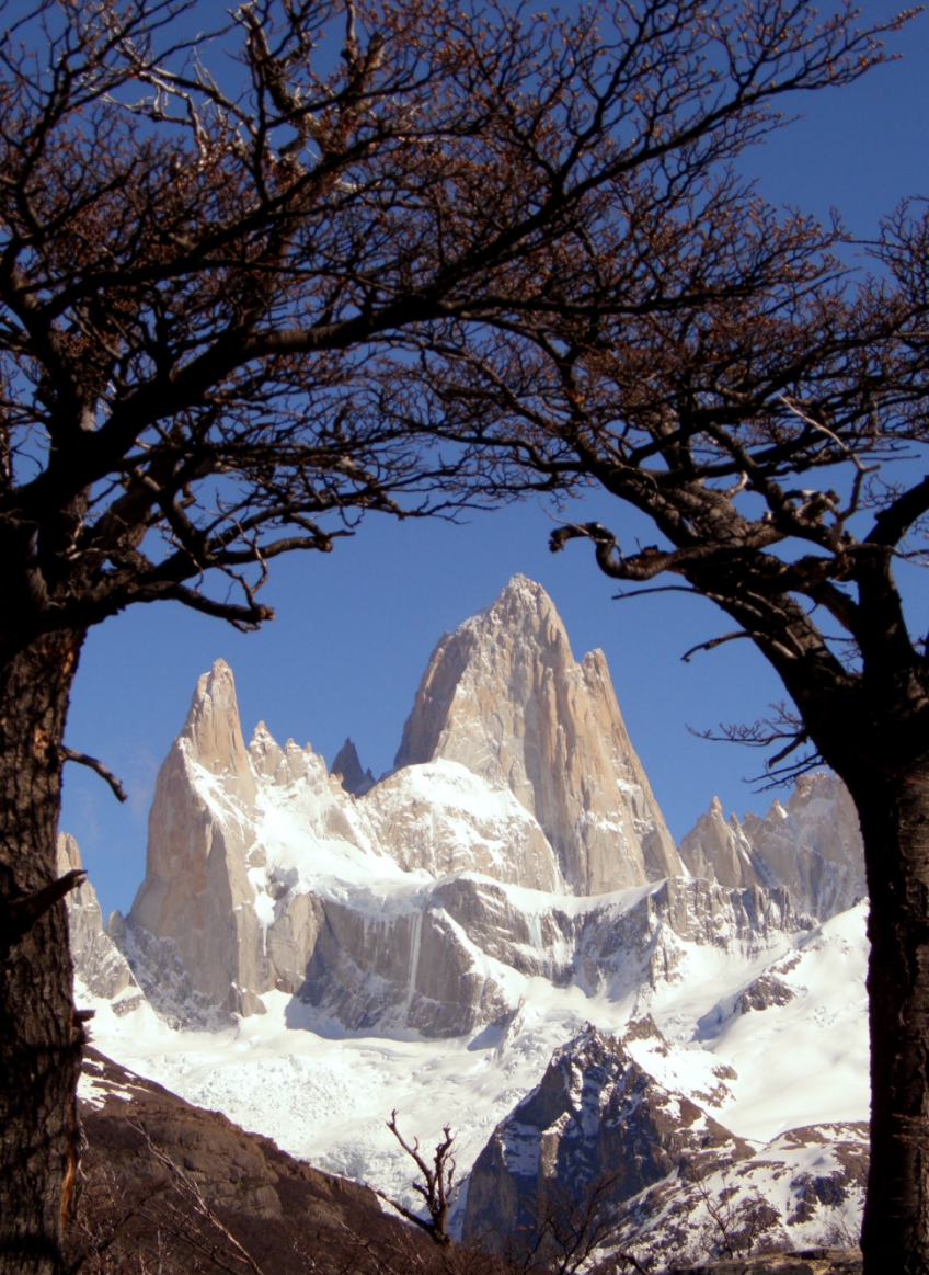
■ Fitz Roy Mountain