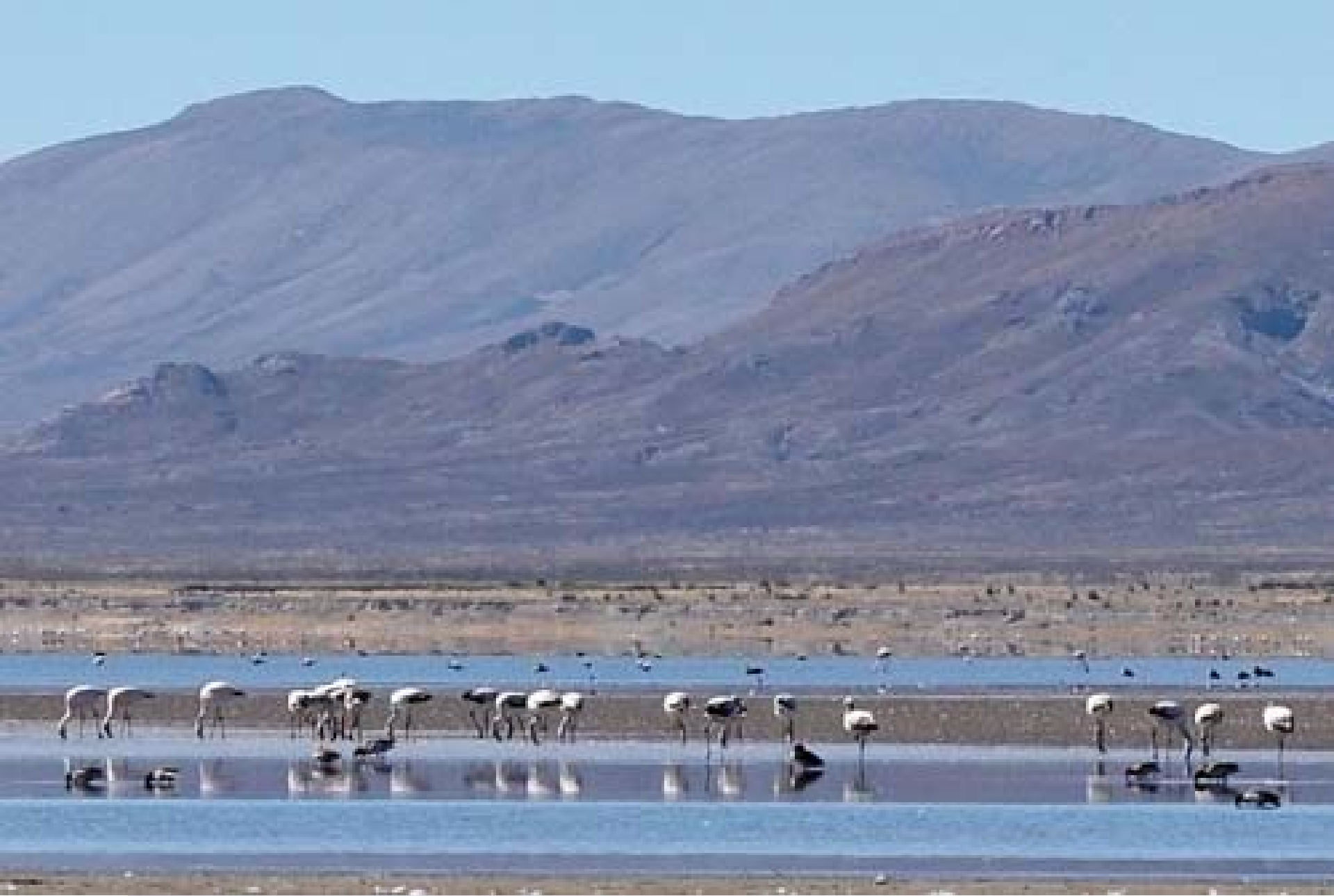
Pozuelos Lagoon Biosphere Reserve