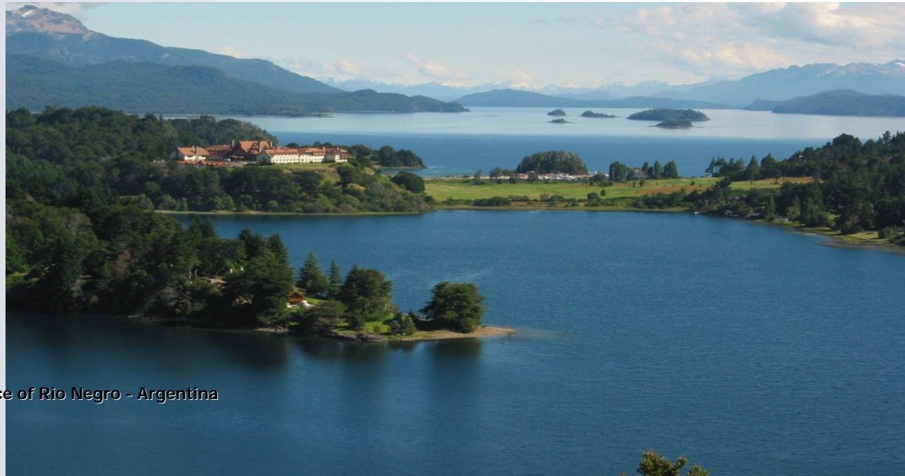
Llao Llao Hotel in the Province of Río Negro - Argentina