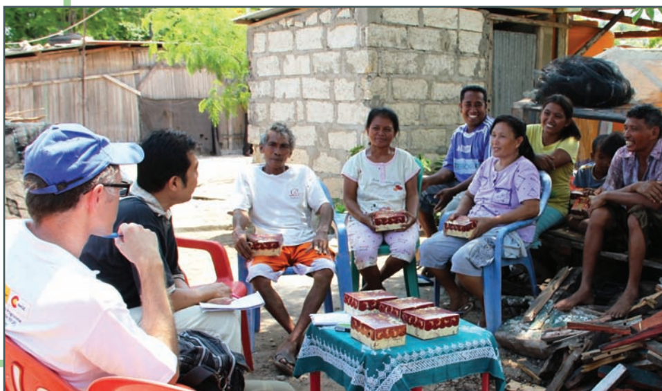
Consultation with communities can help avoid user conflict.

This should cover any limits on FAD numbers, permitted fishing gear and techniques, marking of FADs using lights to prevent boat collision and how fishers will be informed about FAD locations. In addition, rules on on-shore FAD disposal, the type of materials that can be used to build them as well as sanctions for not abiding by regulations should also be included. It is important that this process is undertaken before installing state-funded FADs.