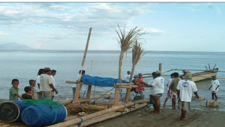
A bamboo payao being launched in Timor-Leste