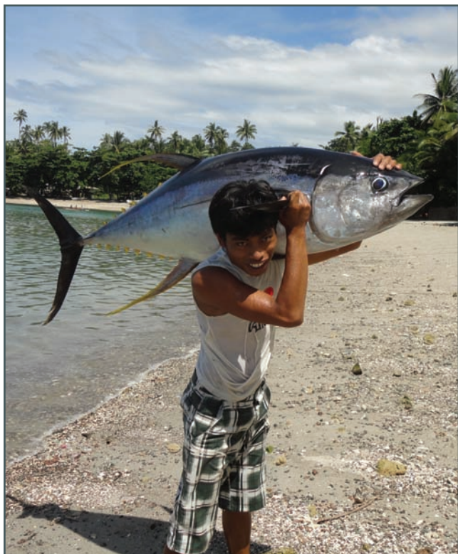
Bringing Yellowfin tuna ashore in the Philippines