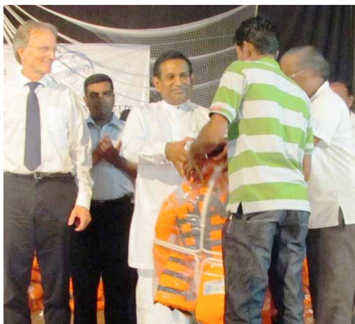
Hon Minister of Fisheries Dr. Rajitha Senarathne hands over a life jacket.