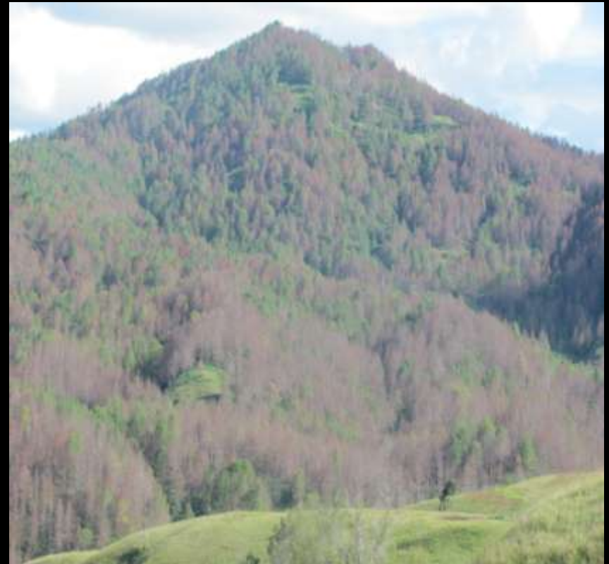
Fyantina Forest fire 2011