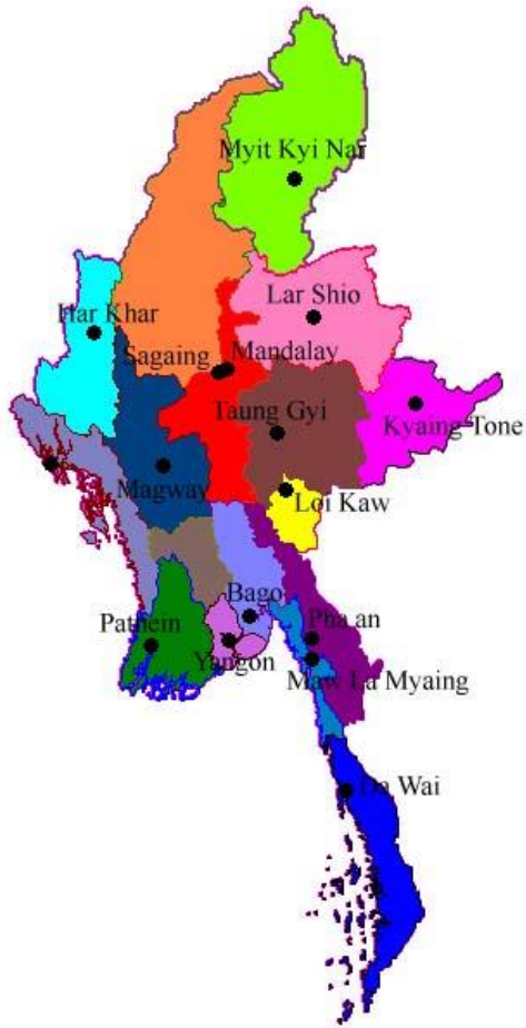
7 Region and 7 States 1 council