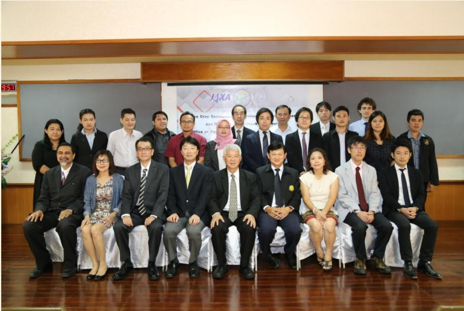
Asia-Rice Crop Estimation and Monitoring (Asia-RiCE) meeting And Rice Growing Outlook Workshop 29-30 October 2014 Office of Agricultural Economics, Bangkok, Thailand