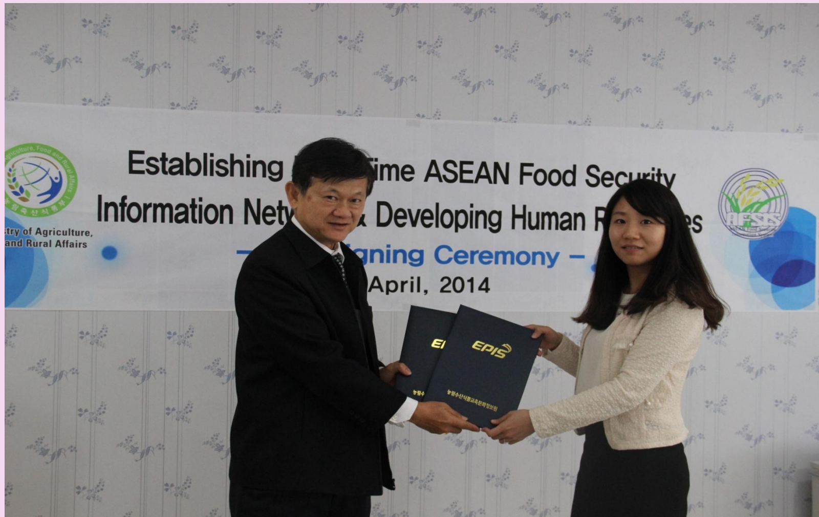
Establishing Real-Time ASEAN Food Security Information Network & Developing Human Resources 2 April, 2014 Office of Agricultural Economics, Thailand