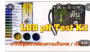
LDD Thailand pH Kit

In some countries, baking soda and vinegar are used for extreme pH observation