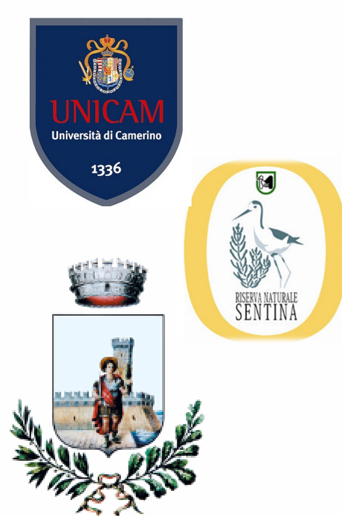
Fig.1. Pictures of the Sentina Natural Regional Reserve.

The objective of the present study is to assess the health of the agricultural soils located within the Sentina Natural Reserve, Marche region (Italy). Two farms (referred as FE and RL sites) involved in pasta and flour production and applying conventional management systems with different degree of intensity, were selected.