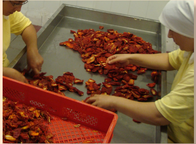
Manual sorting of semi-dried tomatoes. Proper hand hygiene is essential to prevent viral contamination.