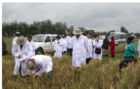
Figure 3: Participants to the Nairobi Summit visiting the Ug99 disease international nursery in Njoro, Kenya (2005)

FAO works closely and directly with governments and is therefore best situated to provide policy advice and advocacy in the areas of prevention, contingency planning and rehabilitation through the development of scenarios and action plans. These include disease surveillance and monitoring, national and international information sharing and enhancement of national varietal registration and seed systems for the quick availability of resistant replacement varieties to the most vulnerable farmers.