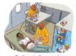
Fadiou ak diouroukayou fadiou yi