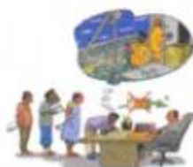
Tann mool yin gay yapp ci gaal gui