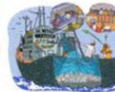
Wakhtou nopalku yi mol bi am