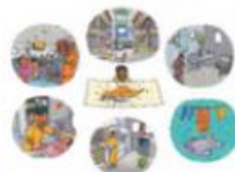
Anami dëkine ak dundine ci gaal gui