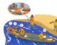
Turu gni ligeey ci gaal gui te dëy ak xarangne ci ssen ligeey