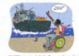
Yellu gnoudelote fa nga bayeko bula ndogal dale