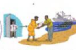
Yorr këyit gu bayeko ci ap doctor guy dëgël sa wër gu yaram