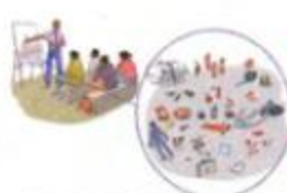
Am xam xam, tay mana fagarou