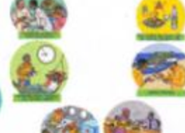
Xaanim këyit biy mandar gaal ligeey bi (contrat)