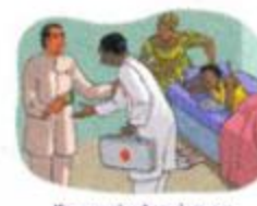
Karangue wër gu yaram ak neekine bi