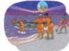
Gën neew amal fuk att ak diouroum been (16 ans)