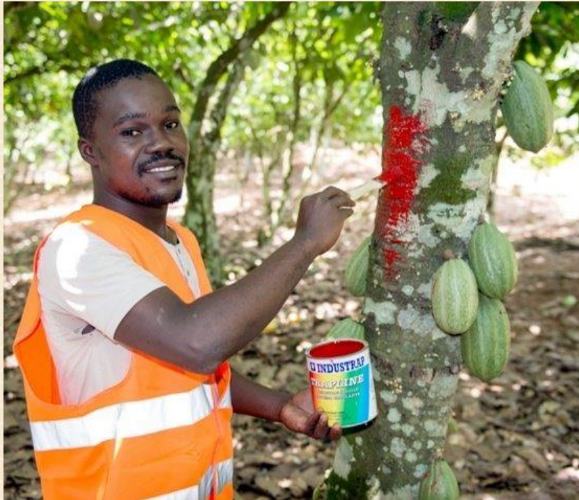
605,000 farms mapped in 2020

82% and 74% traceable cocoa to ensure no deforestation