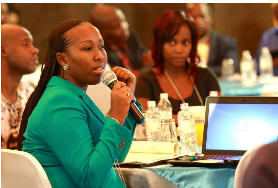
A participant from Rwanda making a contribution during plenary