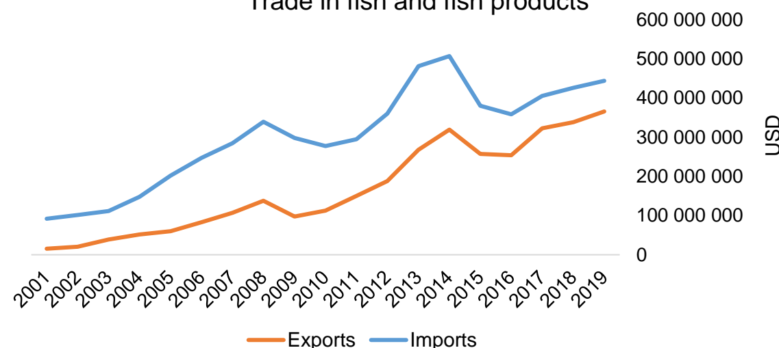
Trade in fish and fish products