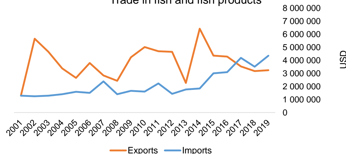
Trade in fish and fish products