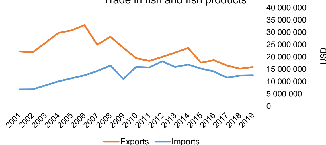
Trade in fish and fish products