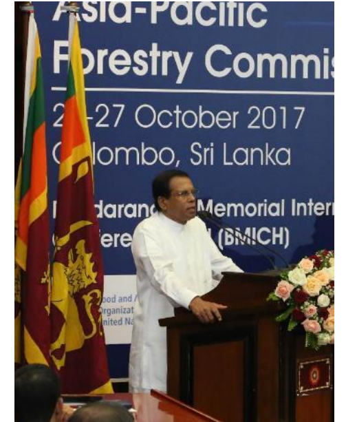
The President of Sri Lanka gave a welcome address during the opening ceremony.