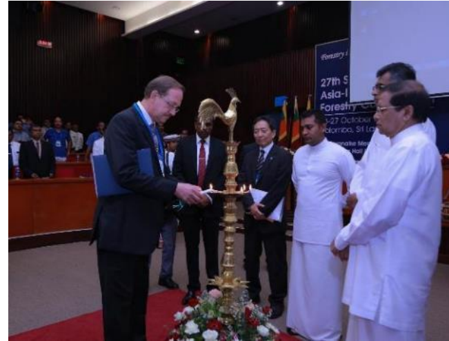
Opening ceremony commenced by a traditional Lighting of Oil Lamp rite.