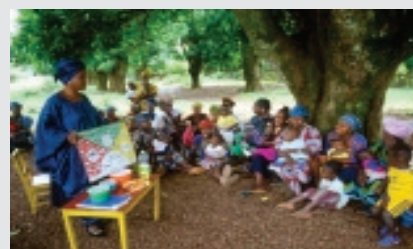
Nursing mothers learn about nutrition.

various programmes, including: literacy circles, clinics and community health, youth centres, and agricultural extension, schools.