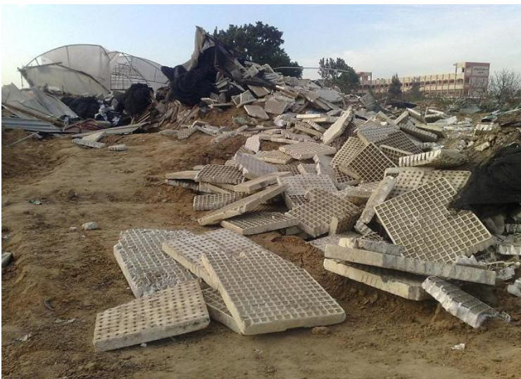
Destroyed vegetable nursery, Al Zeitoun

In the post-conflict phase, FAO will continue to coordinate sectoral efforts to meet new demands. This will include assisting service providers and facilitating market mechanisms to ensure that locally produced food is available and affordable, including meat, eggs, dairy products, fruit and vegetables. Furthermore, FAO intends to restart projects stalled during the closure and conflict, which address the ongoing needs of fishers, small-scale livestock farmers and especially vulnerable groups such as female-headed households.