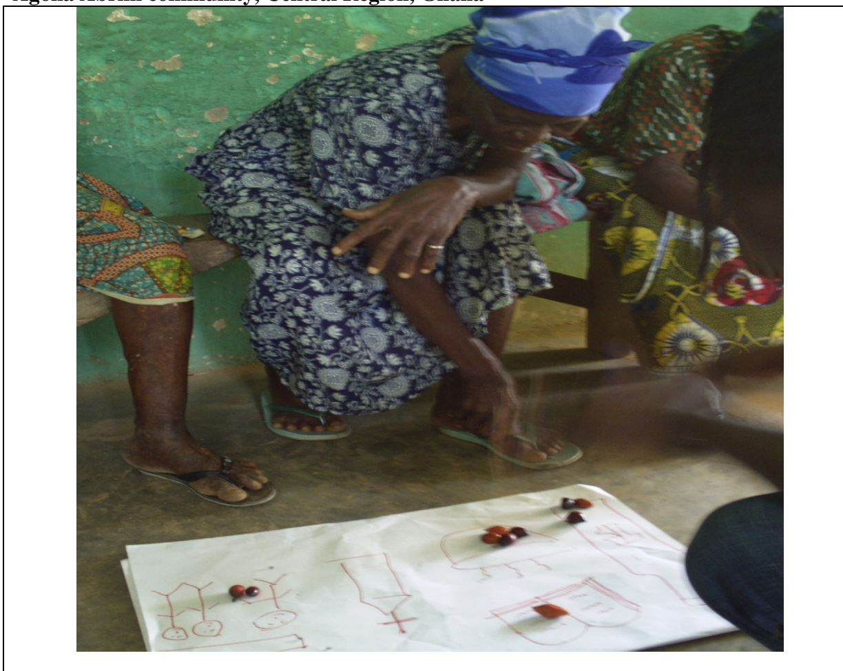
Figure A 2 - Individual analysis of household expenditure by a female beneficiary, Agona Abrim community, Central Region, Ghana

Step 7. Once the individual analysis has been completed, ask some follow-up questions to the whole group to encourage further analytical discussions around the four research themes: