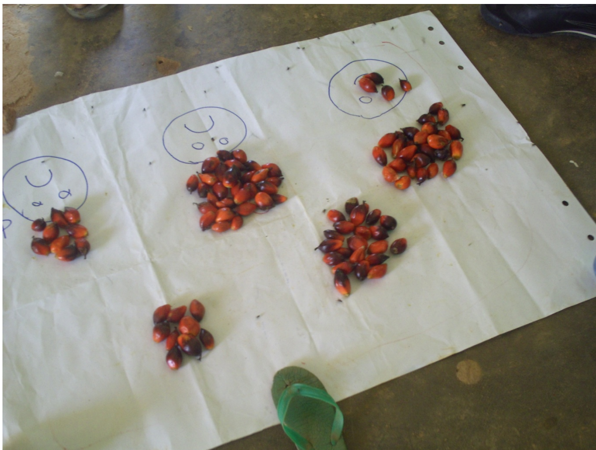
Figure A.2 - Group analysis of well-being categories and seed allocation, Agona Abrim community, Central Region, Ghana

You can later convert your notes into a community well-being analysis matrix (see 0 and 0 for examples), with allocated seeds listed as percentages in the second column.