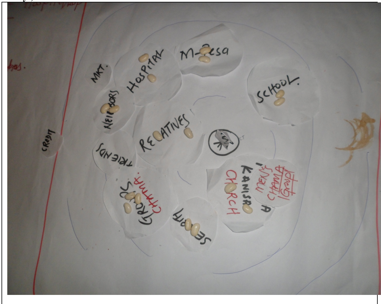
Figure A.3 - Venn diagramming with male non-beneficiaries, Ngoleni sub-location, Kangundo district, Kenya (NB seeds are used here only as weights to stop paper blowing away!)

Step 2. Next, introduce cards (rectangular or circular) in three sizes (small, medium and large) and ask the analysts to write the name of each ‘actor’ on a card, with the size of the card relating to the relative importance of that actor in their lives (i.e. large cards are most important, and small cards least important). Ensure that everyone participates in the discussion regarding the size of circle. Note also the basis for the analysts determining the relative importance.