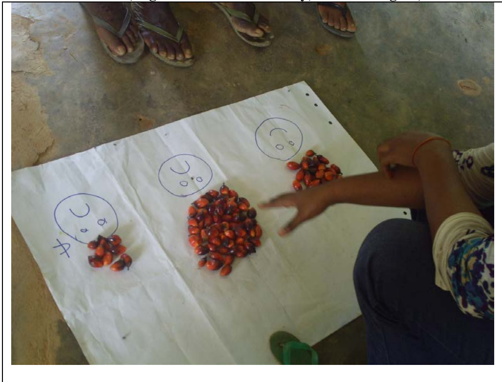
Figure A.1 - Introducing three well-being categories and encouraging an initial allocation of seeds, Agona Abrim community, Central Region, Ghana

Step 2. Ask the analysts to list the characteristics of the beneficiary group (sad face with currency sign). Probe and seek clarification and group consensus. Make careful notes. Note any controversial characteristics that the group cannot agree on. Only prompt on unmentioned issues (e.g. access to land, access to credit) once the group has completed its listing.