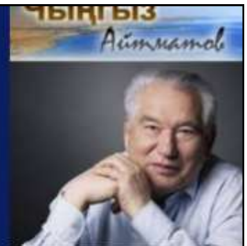
Country of Chyngyz Aytmatov