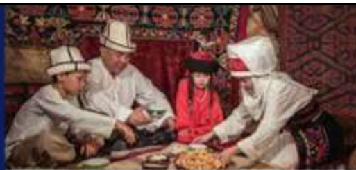
Country of unique, kind and welcoming people