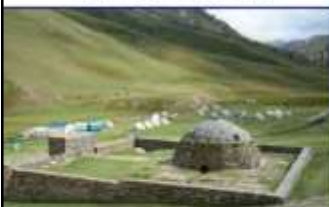
Located along the Great Silk Road