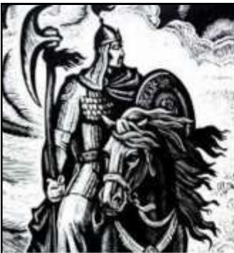
Country of the Great Epic of Manas