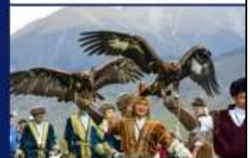
Country of Nomads