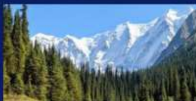
Kyrgyzstan is a true "Mountainous Heaven"