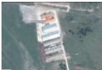
Collection center in Y