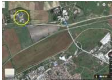
Holding of origin in Y