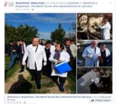
Regional workshop on lumpy skin disease prevention, control, and awareness