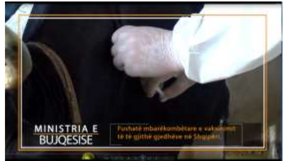
Regional workshop on lumpy skin disease prevention, control, and awareness