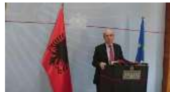
Regional workshop on lumpy skin disease prevention, control, and awareness