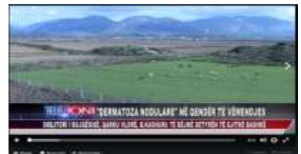
Regional workshop on lumpy skin disease prevention, control, and awareness