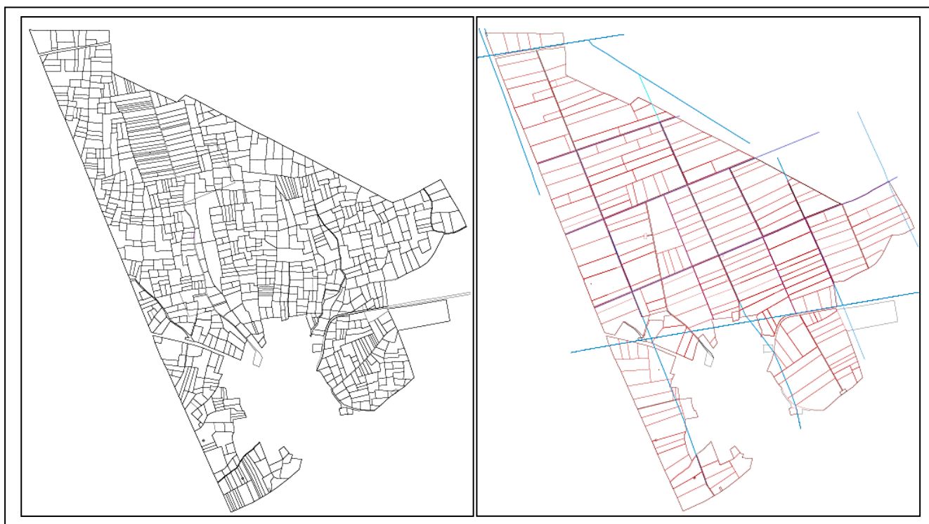
Figure 3: Majority-based land consolidation pilot project in Egri village in FYR Macedonia (2017). Parcel structure before (left) and after (right). The number of land parcels was reduced by a factor 4. Integrated rehabilitation of agricultural infrastructure (roads, irrigation and drainage).

It is the approach of FAO to introduce land consolidation instruments in support of the development of the normal land markets. As discussed in Section 2, agricultural land markets in the 18 FAO programme countries are often not functioning well. Addressing and solving the land registrations problems needs to be an integrated part of the land consolidation process and usually it is recommended to empower the decision making bodies approving the land consolidation project / re-allotment plan also to take decisions on land registration issues related to the landowners and land parcels participating in the land consolidation projects. Without the mandate to adjudicate uncertainties in ownership, it would often not be possible to implement and register the re-allotment plans with the new parcel layout after the land consolidation projects.