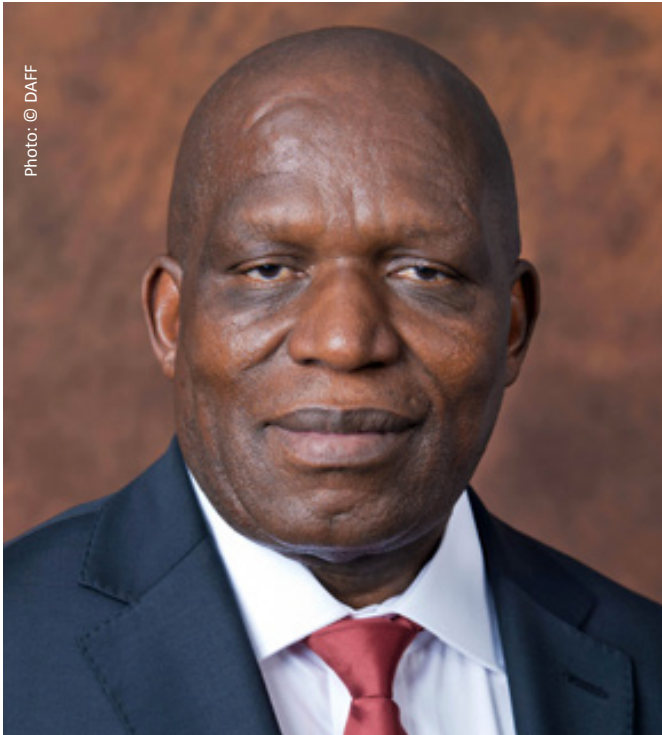
Mr Senzeni Zokwana, MP

Minister of Agriculture, Forestry and Fisheries, Republic of South Africa