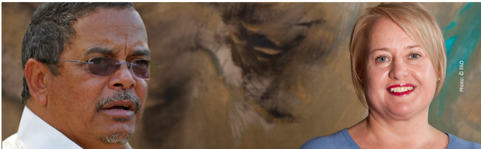
Trevor Abrahams Secretary-General of the XIV World Forestry Congress