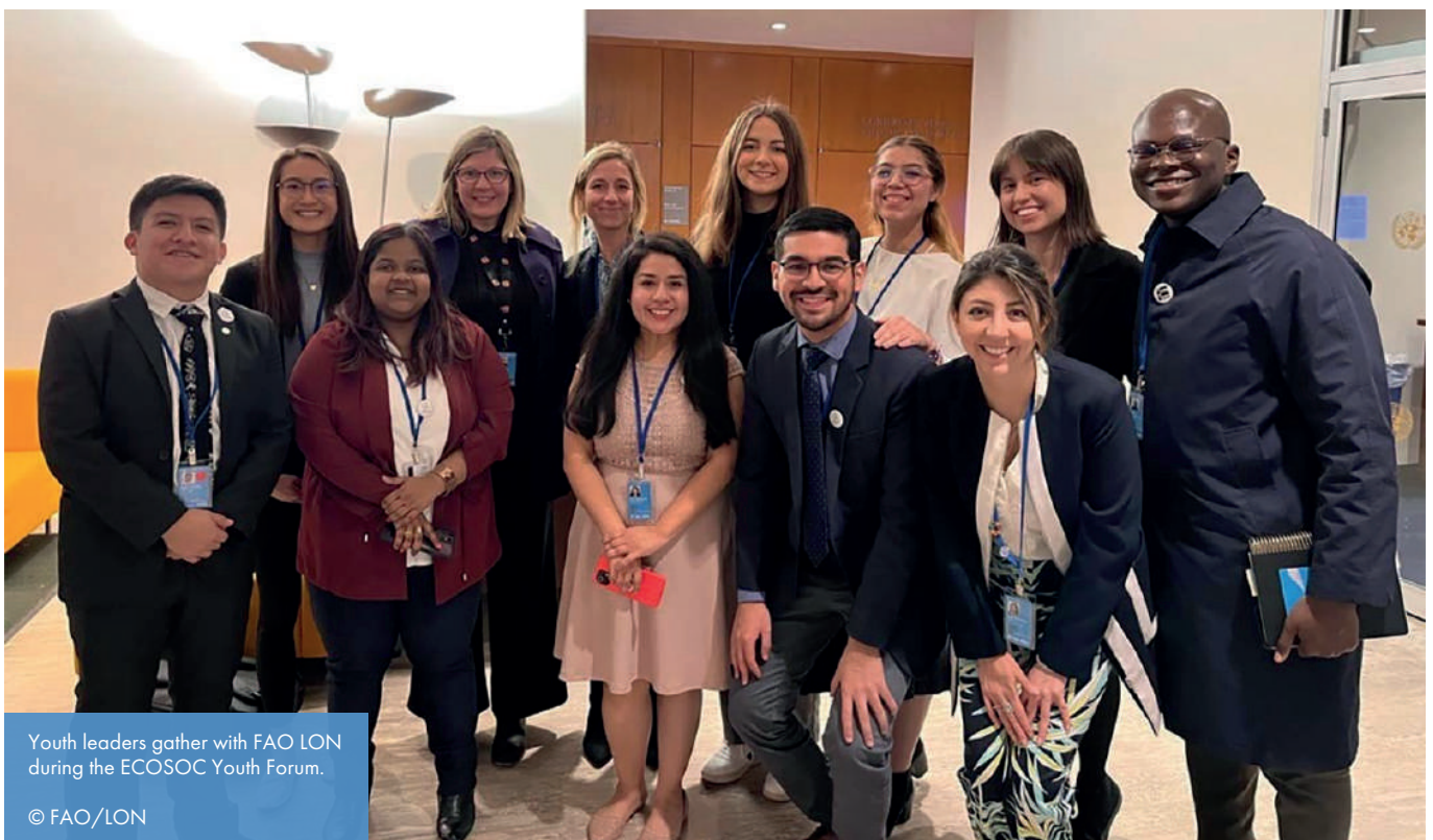
Youth leaders gather with FAO LON during the ECOSOC Youth Forum.

From 24 to 27 April 2023, the WFF YPB actively participated in the ECOSOC Youth Forum 2023 in New York. The Board engaged in various events, discussions and meetings, highlighting the role of agrifood systems in achieving the SDGs, promoting youth engagement in the sector and fostering collaborative partnerships with key stakeholders.