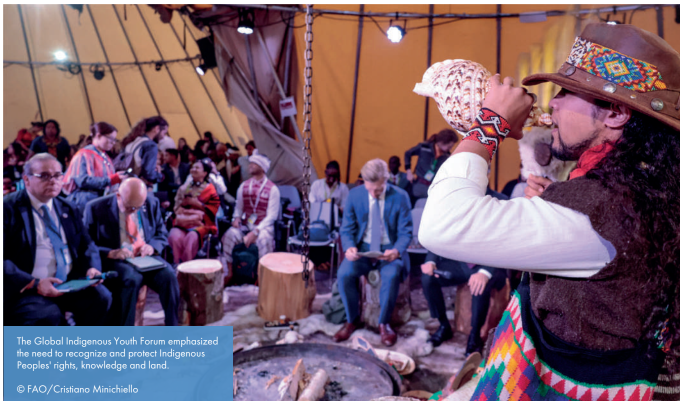
The Global Indigenous Youth Forum emphasized the need to recognize and protect Indigenous Peoples' rights, knowledge and land.

The Forum's focus this year centred on making policy recommendations derived from the Youth campaign, " My Food Vision is... ", and two previous declarations on Youth formulated at FAO. Indigenous Youth engaged with FAO management, member countries, United Nations agencies, universities, and other partners, with discussions spanning topics like ultra-processed foods, school meals programmes, commercialization, and environmental concerns affecting Indigenous Peoples' foods, lands and waters. The Forum also included music, food, roundtable discussions, and an art exhibition showcasing Indigenous food and knowledge systems.