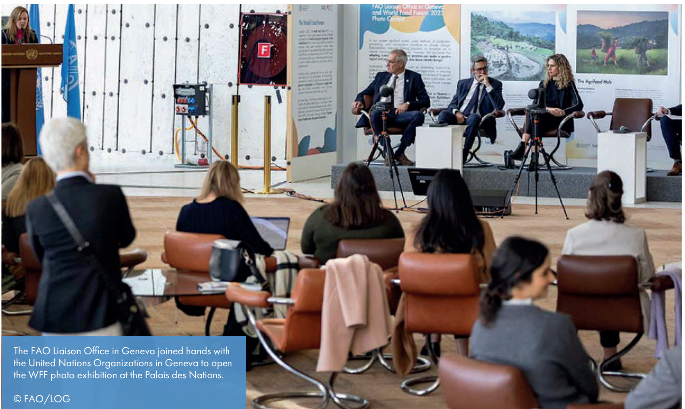
The FAO Liaison Office in Geneva joined hands with the United Nations Organizations in Geneva to open the WFF photo exhibition at the Palais des Nations.