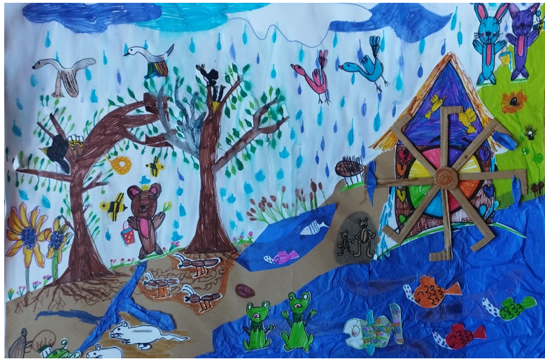
"Ladybugs" preschool class, 6 years old, Serbia