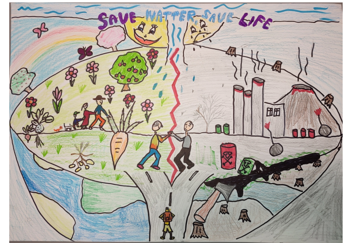
Sára, 7 years old, Slovakia