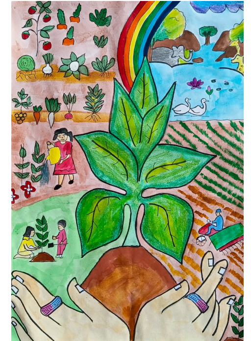
Saanvi, 10 years old, India