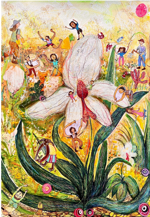
Jui-Yi Hsu, 10 years old, China